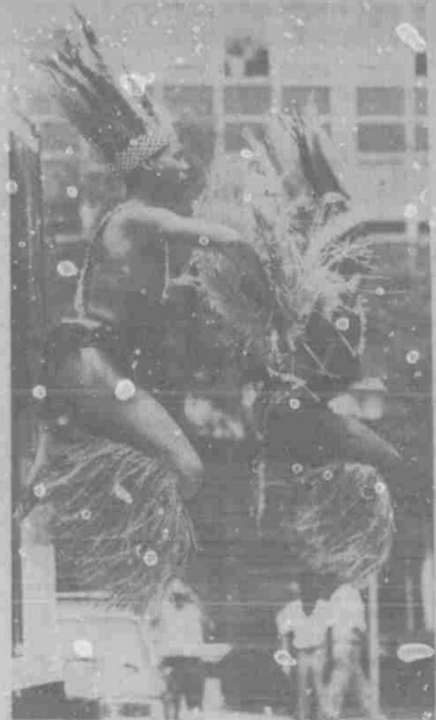
These African dancers aren't really out of touch with the times. They are performers in Jazz Is , a vaudeville-style touring production that traces the history of jazz from African rhythms to today's modern sound. Sponsored by R. J. Reynolds Industries, Inc., Jazz Is is produced by the North Carolina School of the Arts and is appearing in more than 20 cities this summer.