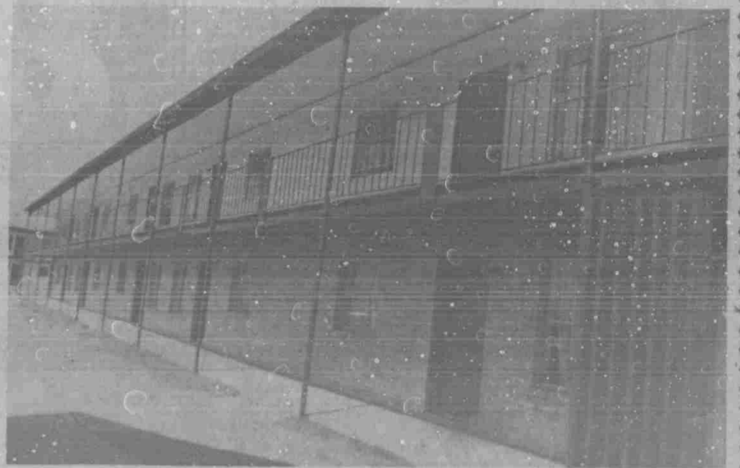
Another Outside View