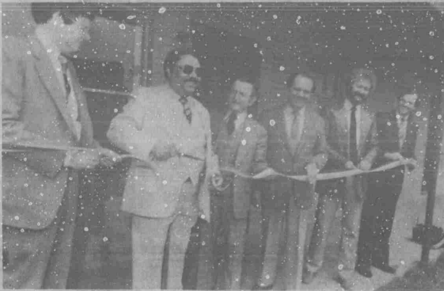
Recent Ribbon Cutting & Open House