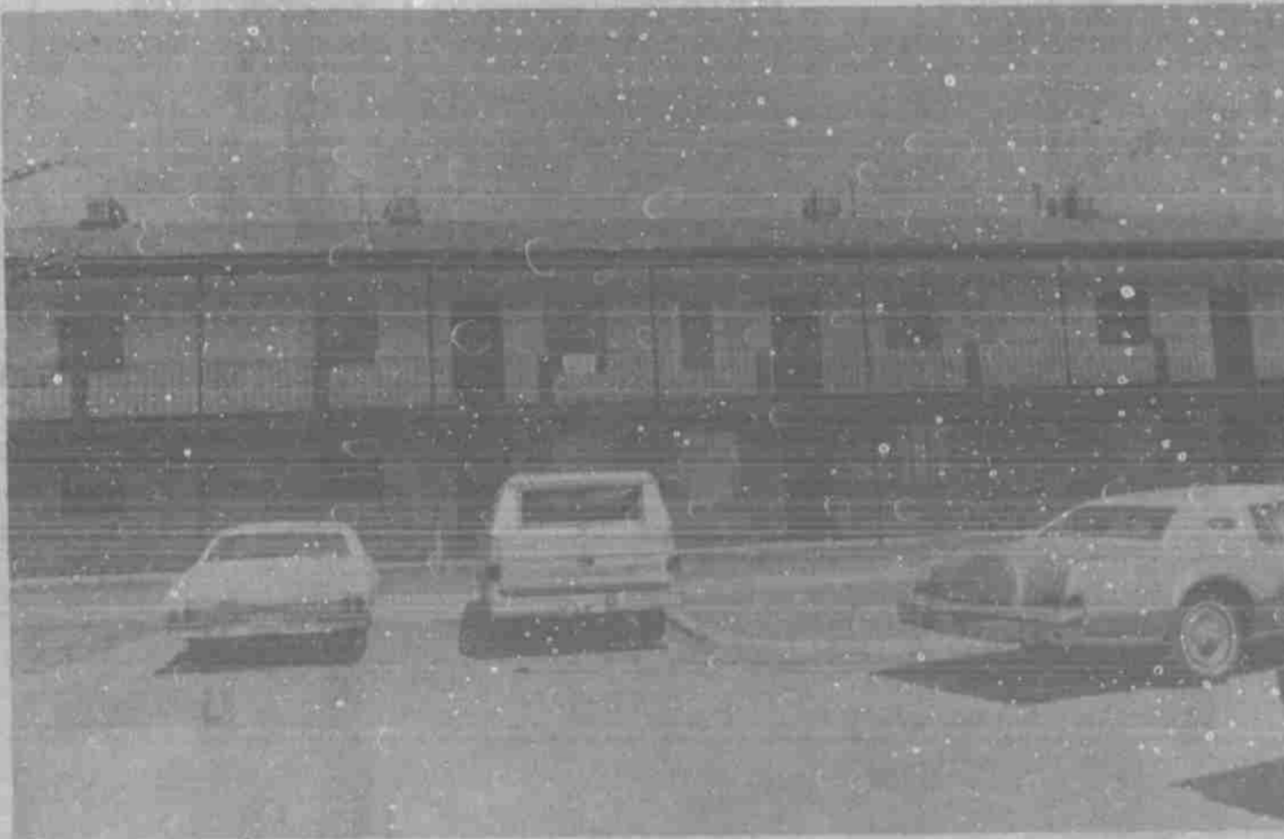
Parking Lot & Apartment Buildings