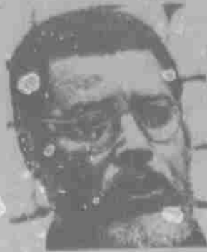
Actor James Earl Jones, Nancy Marchand and Ken Howard (top left to right) deliver stirring oratory of Frederick Douglas. Eleanor Roosevelt and President John F. Kennedy in the new PBS series FREEDOM TO SPEAK.