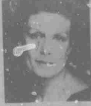
The performers are among a host of distinguished actors who portray the nation's outspoken leaders as they debate issues which helped shape our history. William F. Buckley, Jr. is host. Produced by WQED/Pittsburg and