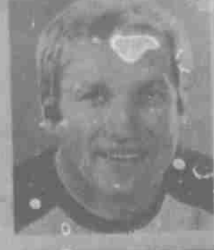
underwritten with a grant from AT&T and the Bell Systems Companies, the 12-part series of half-hour programs premieres Thursday, February 17 at 9 p. m. on KTXI, Channel 5.