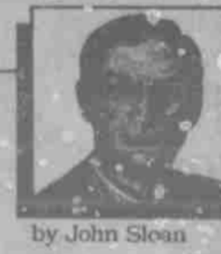
by John Sloan