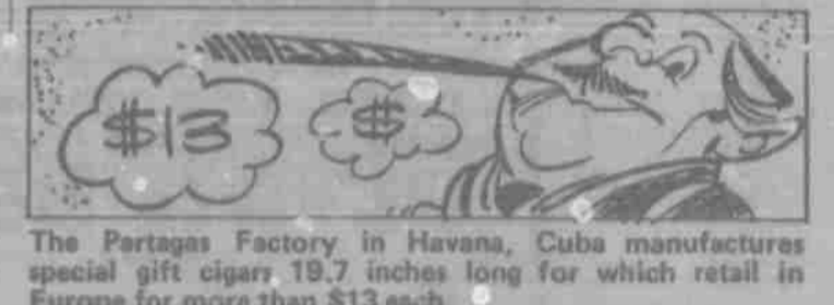
The Partagas Factory in Havana, Cuba manufactures special gift cigars 19.7 inches long for which retail in Europe for more than $13 each.

The Civil Rights Movement taught that survival comes from strength and that if black theology is to survive in America as an individual entity which represents the best interests of Black America, it will have to be supported by financial and political muscle in the same way that the white theologies rely on politics and money for their support.