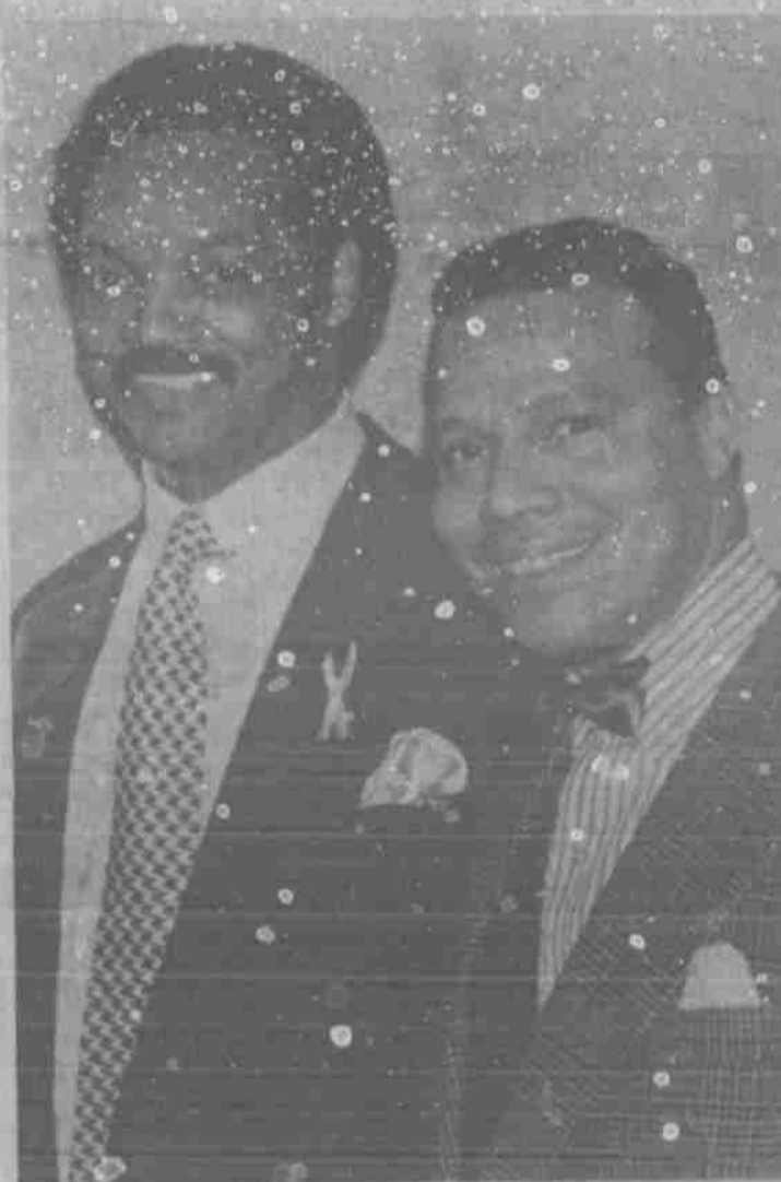
Rev. Jesse L. Jackson & Minister Louis Farrakhan

Rev. Jesse L. Jackson will join Min. Louis Farrakhan and the Nation of Islam on Saturday evening for a mass political rally entitled "A Unified Political Strategy," at the