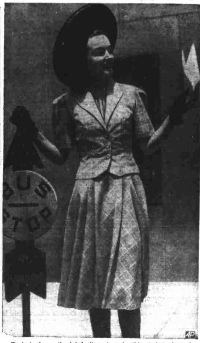
Typical of smartly-styled city cotons is this jacket dress in pastel plaid gingham.

By AMY PORTER AP Fashion Writer This is the biggest soap and water season in fashion history.