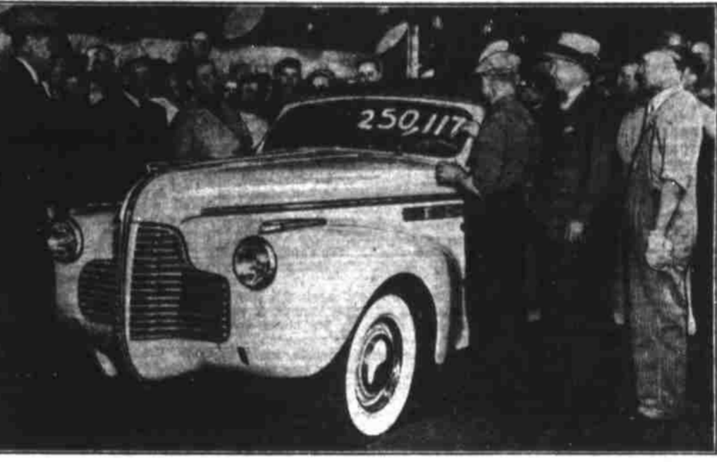
WHEN BUICK'S 1940 model Number 250,117 rolled off the assembly line this week the all time high production record, established in 1927, was exceeded.

PITTSBURGH (UP)—A new device, designed to be hit by direct lightning bolts, has been installed atop the University of Pittsburgh's 23-story Cathedral of Learning.