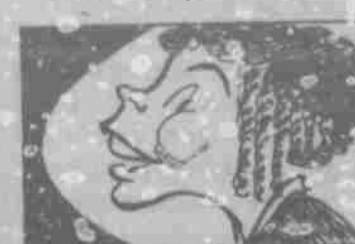
Se cree que la primera vez que hizo su aparición el estilo de pelo africano natural fue en la persona de Cicely Tyson en La Camera T. de CBS en 1959.