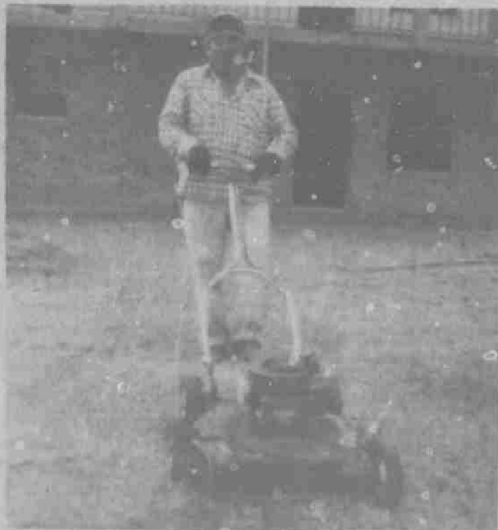
Lawn Looking Good!