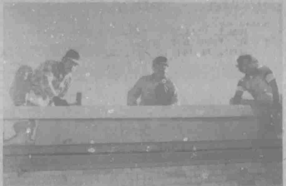
Getting Roof Right!!