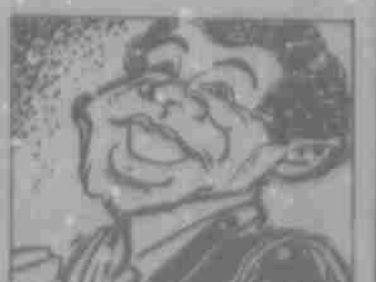
In 1928 Oscar DePriest became the first Northern Black to be elected to the U.S. House of Representatives.

You may write to your Congressmen and Senators at: Congressional Office Building, Washington, D.C. 20515 or Senate Office Building, Washington, D.C. 20510. Please congratulate them for their important work and let them know every week where Black America stands on crucial issues.