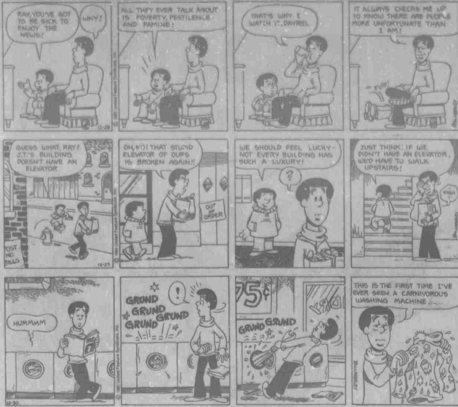
UNITED FEATURE SYNDICATE, 200 Park Avenue, New York, N.Y. 10166, (212) 557-2333