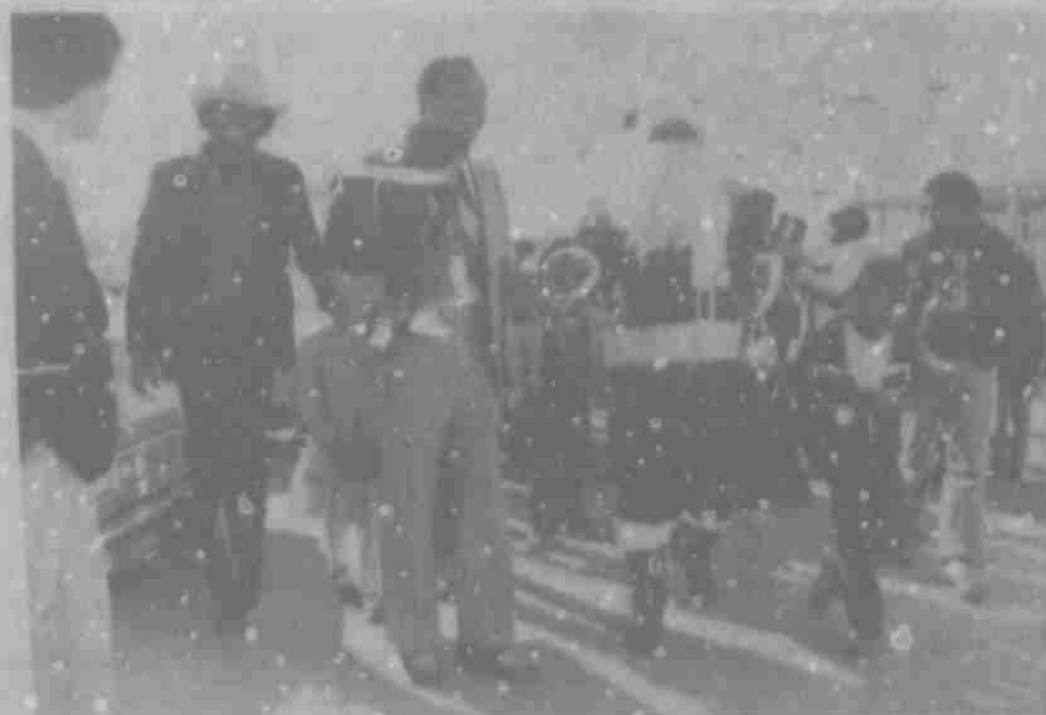
SANTA LEADS PARADE - Last Saturday afternoon Santa Claus had an opportunity of leading the parade at 1701 Parkway Drive after stopping the Parkway Mall. Hundreds of kids were on hand for the affair.

(More pictures on Page 8) Continue on Page 8