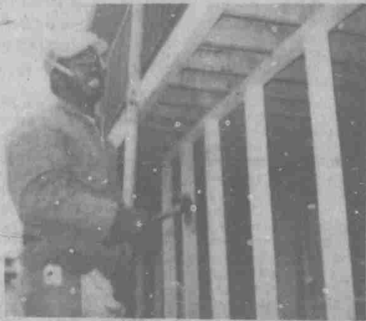
Brother Getting It Ready!!

Santa comes to East Lubbock! In his bag for the East Lubbock come the East Lubbock stockin's was the Phenix