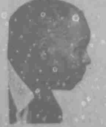
Roy Wilkins Succumbs Roy Wilkins, longtime leader of the National Association for the Advancement of Colored People (NAACP) died Tuesday morning at the age of 80. Wilkins served as President of the NAACP for 22 years.

who have been absent from any class or classes Continue on Page 2