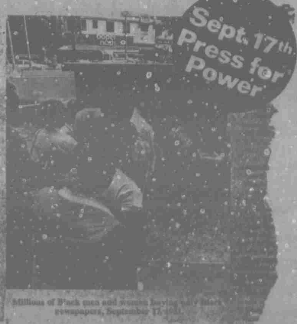
Millions of Black men and women buying only Black newspapers, September 17, 1981.

September 17th is brought to you by BOCA who is proud to be sponsoring this Press for Power.