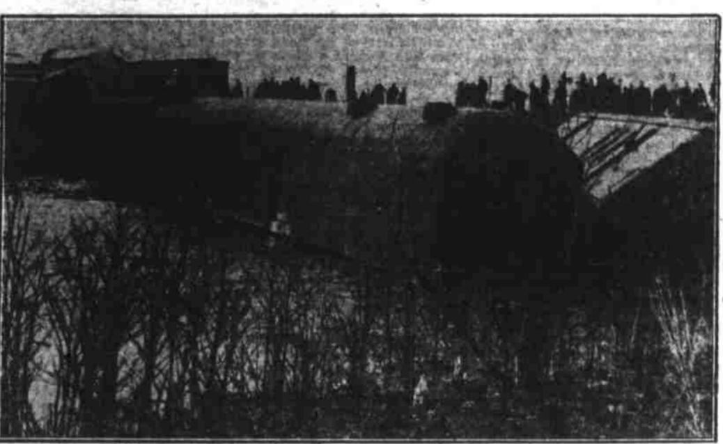
Twenty-five passengers were injured when the New Orleans bound train of the Gulf, Mobile and Northern Railroad company was derailed at Monticello, Miss., while numerous others were shaken up but none seriously hurt in the derailment of the "Louisiana," New Orleans-Chicago passenger train of the Illinois Central near Kimmundly, Ill. The picture at the top shows the Monticello wreck, apparently caused by a broken rail, while below is shown the baggage and mail cars and one passenger coach of the "Louisiana" partially submerged in a pond.