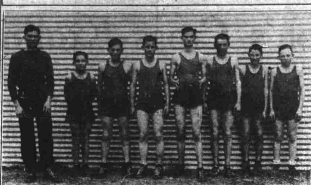
Pictured above is the Forsan Junior basketball team, answer to where many of the outstanding players on the Buffalo team received their first experience.