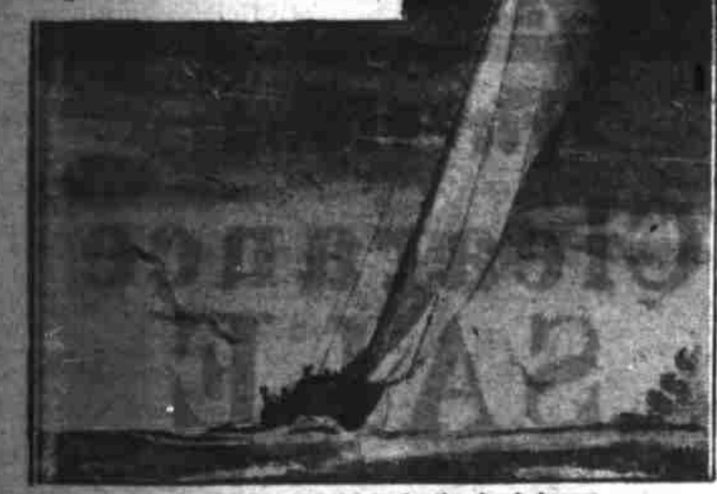
We bowled along briskly in the fresh breeze.

Admirably well, there was little to be seen but a dreary expanse of marshland. Now and then a clump of trees rose above the roof of some isolated farm-house, but their