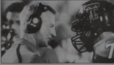
Will the real Texas Tech please stand up?

First the Red Raiders knock off No. 3 Oklahoma in Norman, snapping the nation's longest home winning streak in the process. Then, riding high on that victory and returning to the national rankings, Texas Tech shows up flat and gets drubbed at home by Iowa State, one of the worst teams in the Big 12.