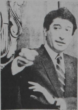
by Henry Cisneros

become advocates for change in one of the most fundamental issues confronting America today, matters are going to get a lot worse. One trend involves the direction our national economy has taken. The gap in income distribution is widening. Millions of manufacturing jobs that used to pay $15 and $17 an hour have been lost, only to be replaced with $5 and $7 an hour service jobs.