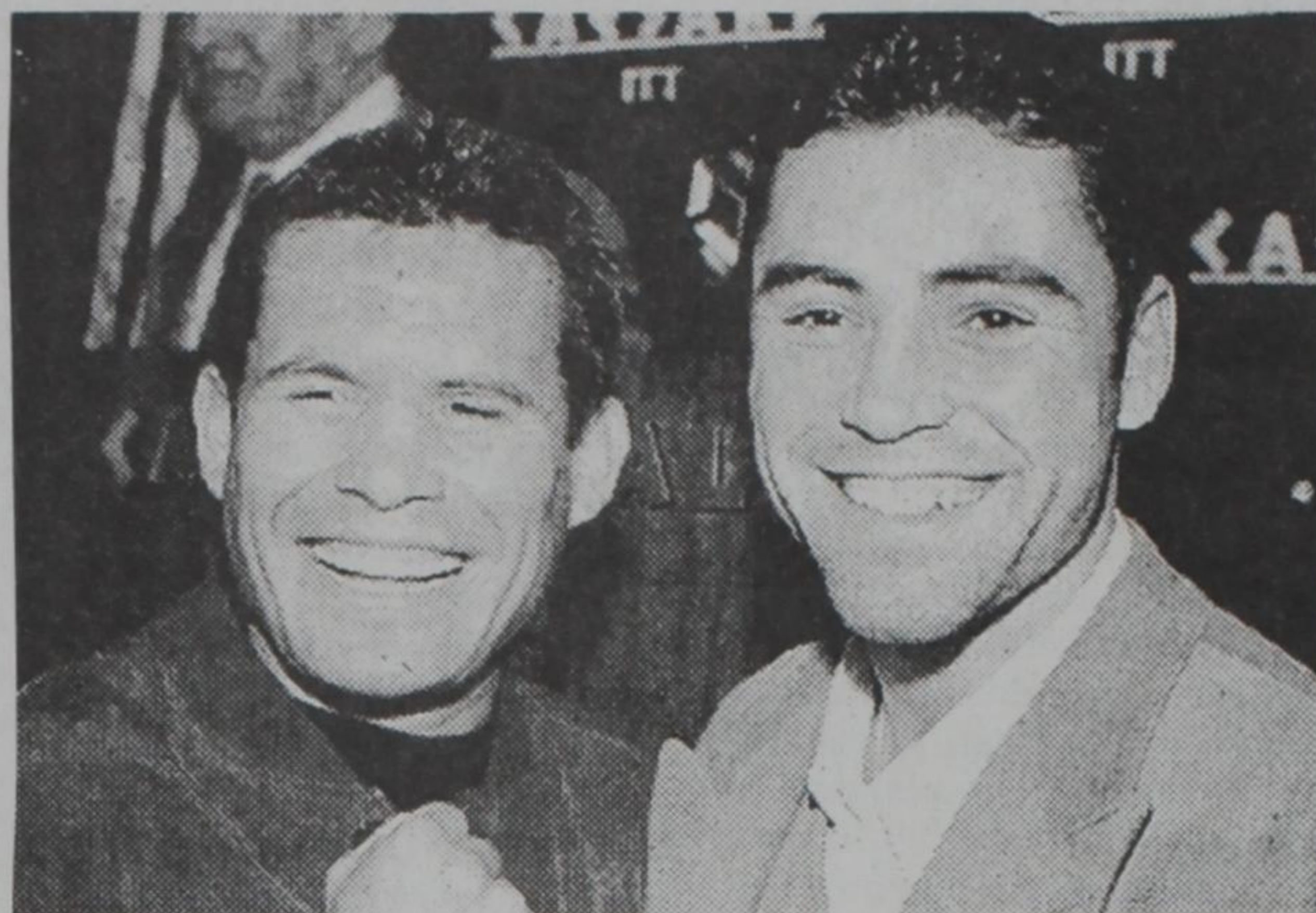
Tanto Julio César Chávez como Oscar de la Hoya aseguran que saldrán ganadores en la pelea que sostendrán el próximo 7 de junio en Las Vegas, donde JC expondrá su corona superliger del Consejo Mundial de Boxeo.

Ciudad de México--Bob Arum dio a conocer ya la gira promocional que realizarán Julio César Chávez y Oscar de la Hoya con miras a la pelea que sostendrán el 7 de junio en Las Vegas, Nevada, en donde el campeón mexicano expondrá la corona superliger que reconoce el Consejo Mundial de Boxeo.