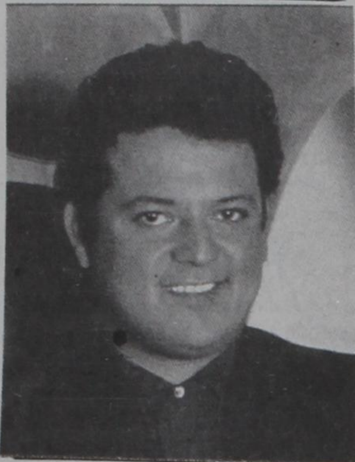
of spectacular comedic talent to our subscribers."