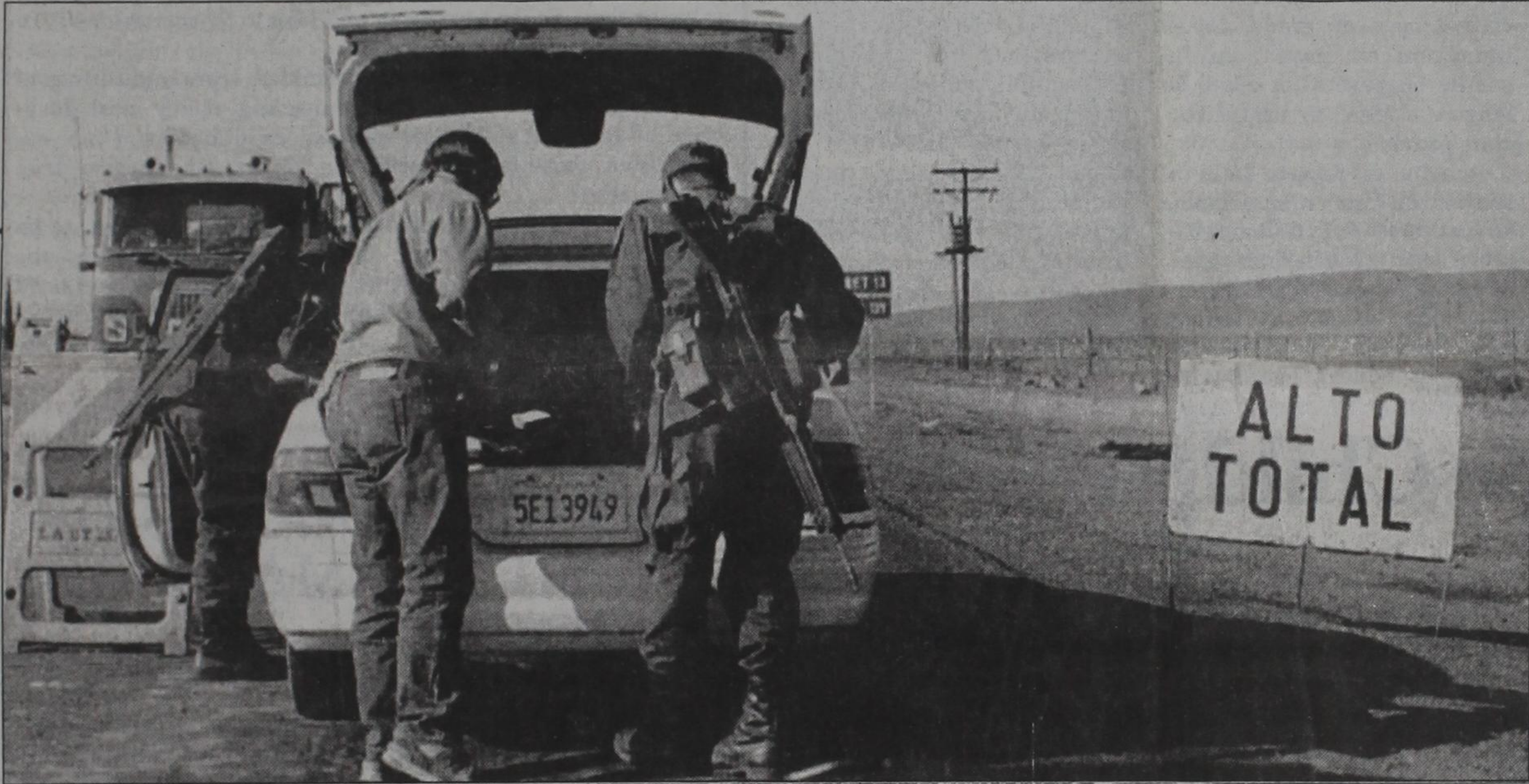
Federal soldiers search the trunk of an American's vehicle recently in Baja California. Even tourists who flock to

Established 1977 - Texas' Oldest Hispanic Owned Newspapers