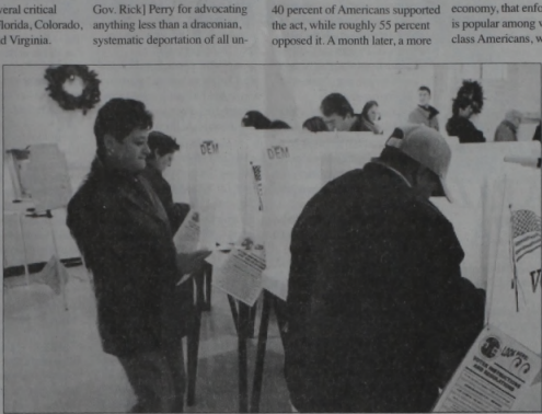
Democrats are working to scare up Hispanic votes by attacking the immigration policies of Republican presidential candidates.

Still, he warned the GOP can't win a majority of Hispanics when running against a tax-and-spend Democratic candidate. "Immigrants are rational, and because they're poorer than the average American, they seek large government programs," which the Democrats are eager to provide, he concluded.