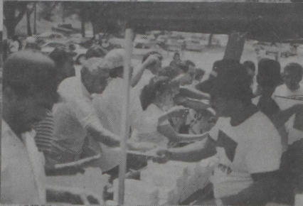
Feliz Año Nuevo 1988