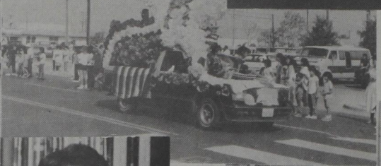
Feliz Año Nuevo 1988