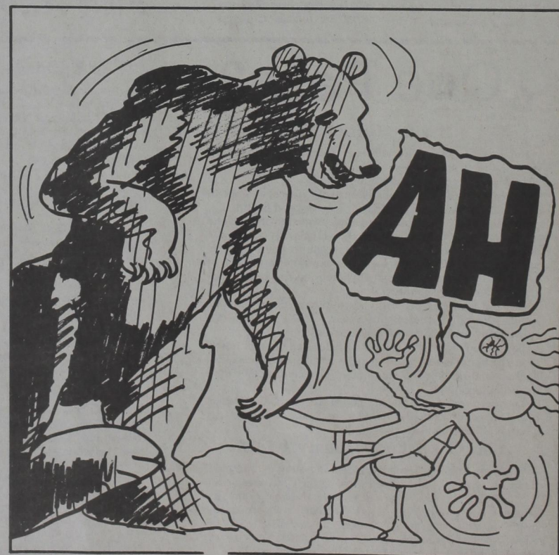
ESPERE LO QUE NO ESPERA—SI SE ENBORRACHA!