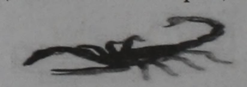
Back in the 70's and 80's "El Alacrán"; "the scorpion that stings with his tail" was a regular guest on the pages of this newspaper.

Hay en este mudo un tribo de gentequien les llaman "Tontos". Esta gente mp sabe jacer decosopmes u [pr si caisa ,icja gente sifre sis ,ajecjps/ Por ejemplo, la majoria de estaa gente no va votar y si van a votar van a dar su voto a el companero de George Bush llamado McCain. Pobresitos tontos. Ah y fijese que nos dice que aqui en Lubbock tambien hay tontos. Aqui no les voy a decir porquien van a votar pero sus iniciales son G.F.