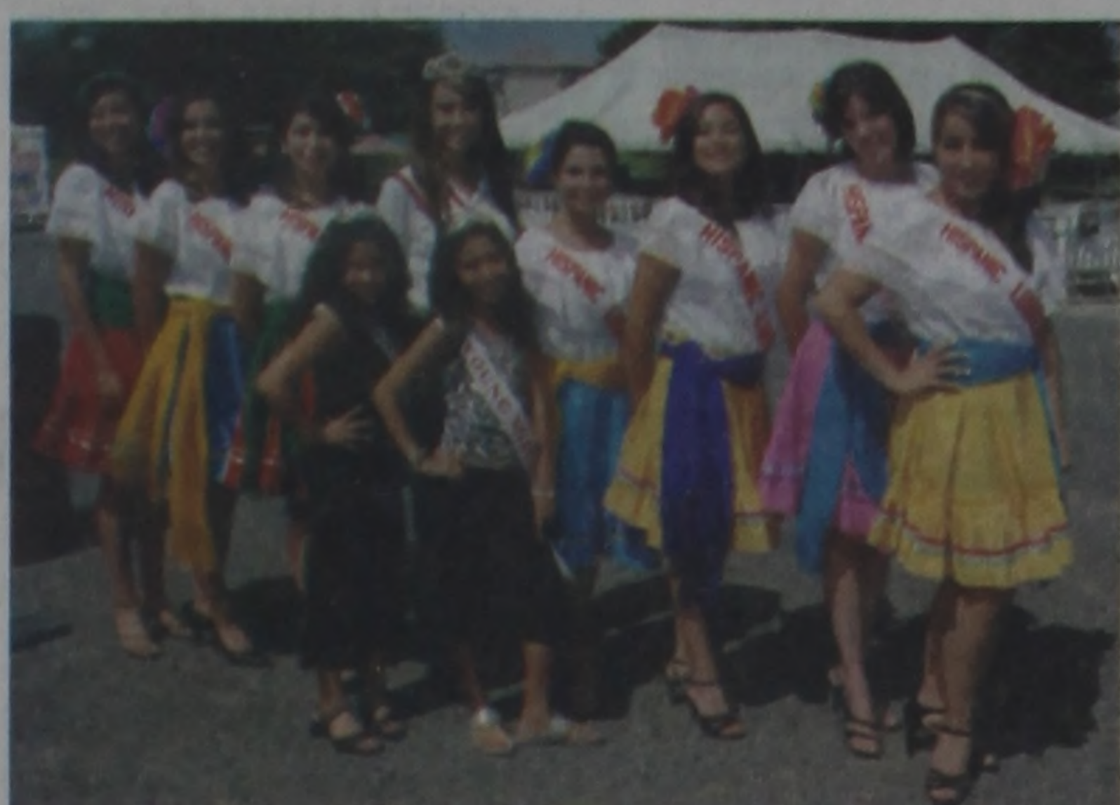
All the contestants of Miss Hispanic Lubbock Scholarship Pageant gathered to participate at the ribbon cutting ceremony for the Fiestas del Llano this past week. There were a total of seven contestants and three GEM princesses pageant participants. Job well done on behalf of all of them.