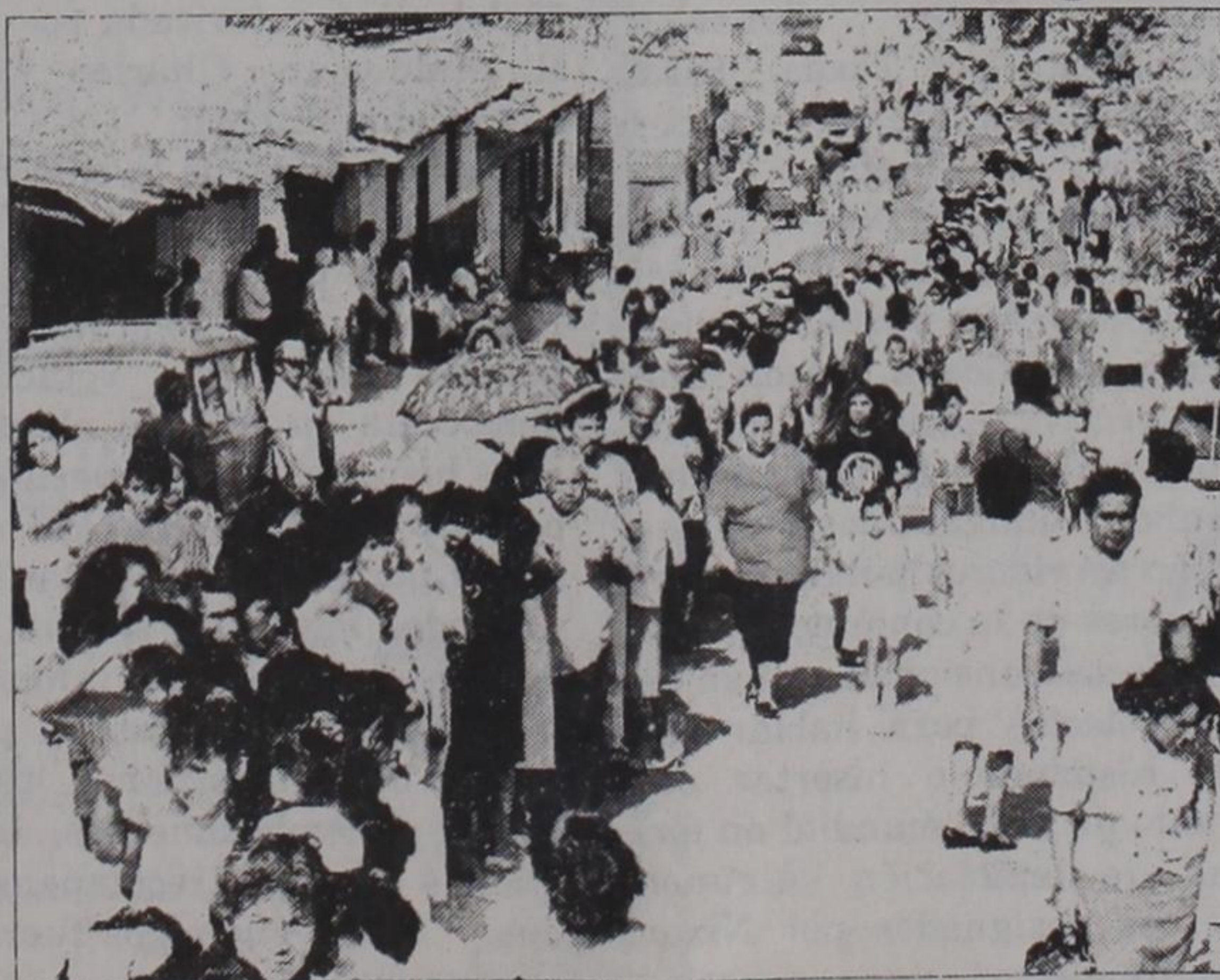
Los votantes congestionaron las Juntas Electorales; muchos de ellos no votaron y no fue por falta de voluntad.