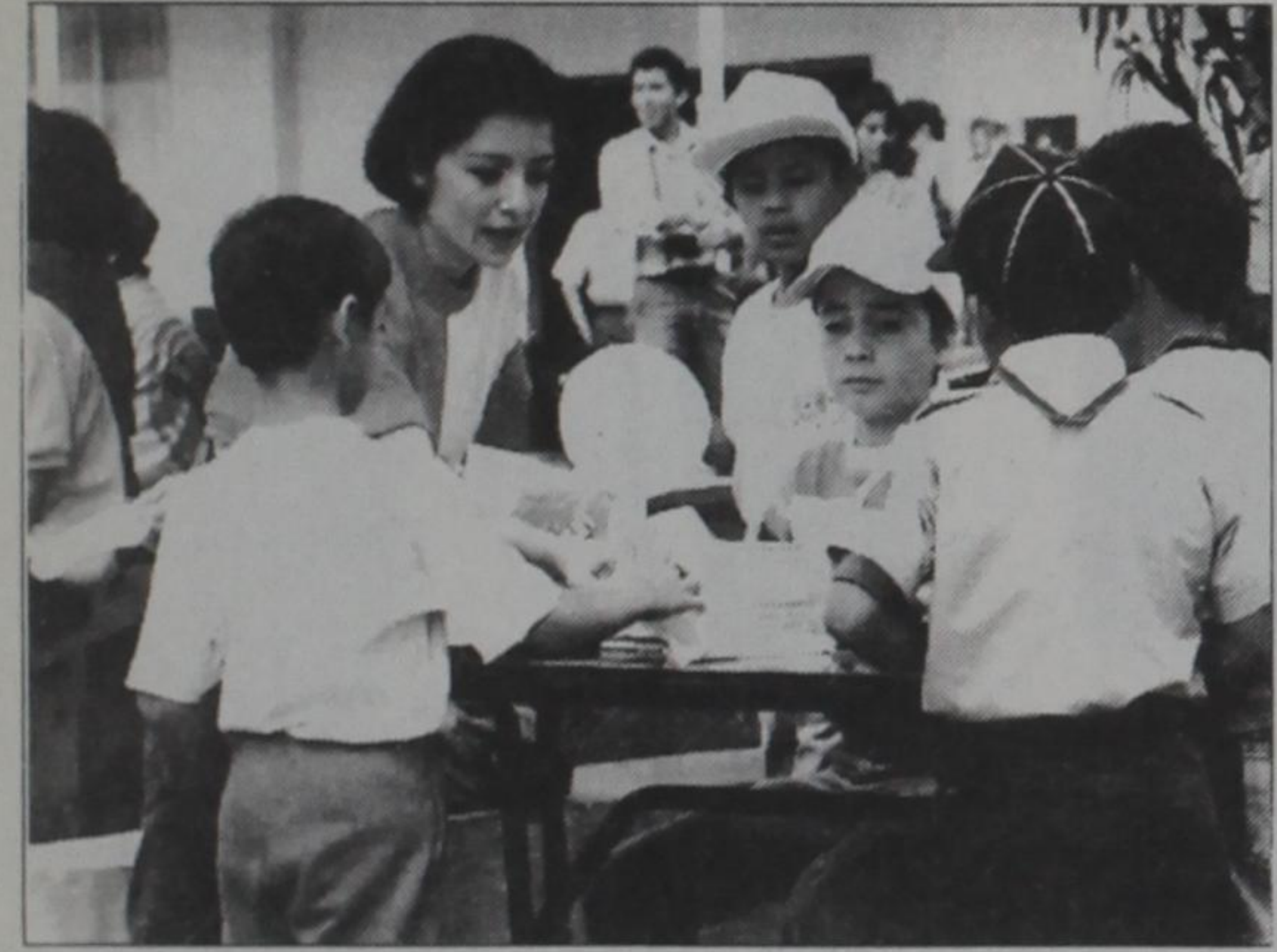
Las elecciones infantiles de la Universidad Tecnológica, también le dieron el triunfo a ARENA.

El frente decidió presentar candidatos a diputados y alcaldes, pero titubé ente un candidato presidencial propio o apoyar a otro partido. El ERP (Ejército Revolucionario del Pueblo) y la RN (Resistencia Nacional) pugnaron por uno propio. El PCS