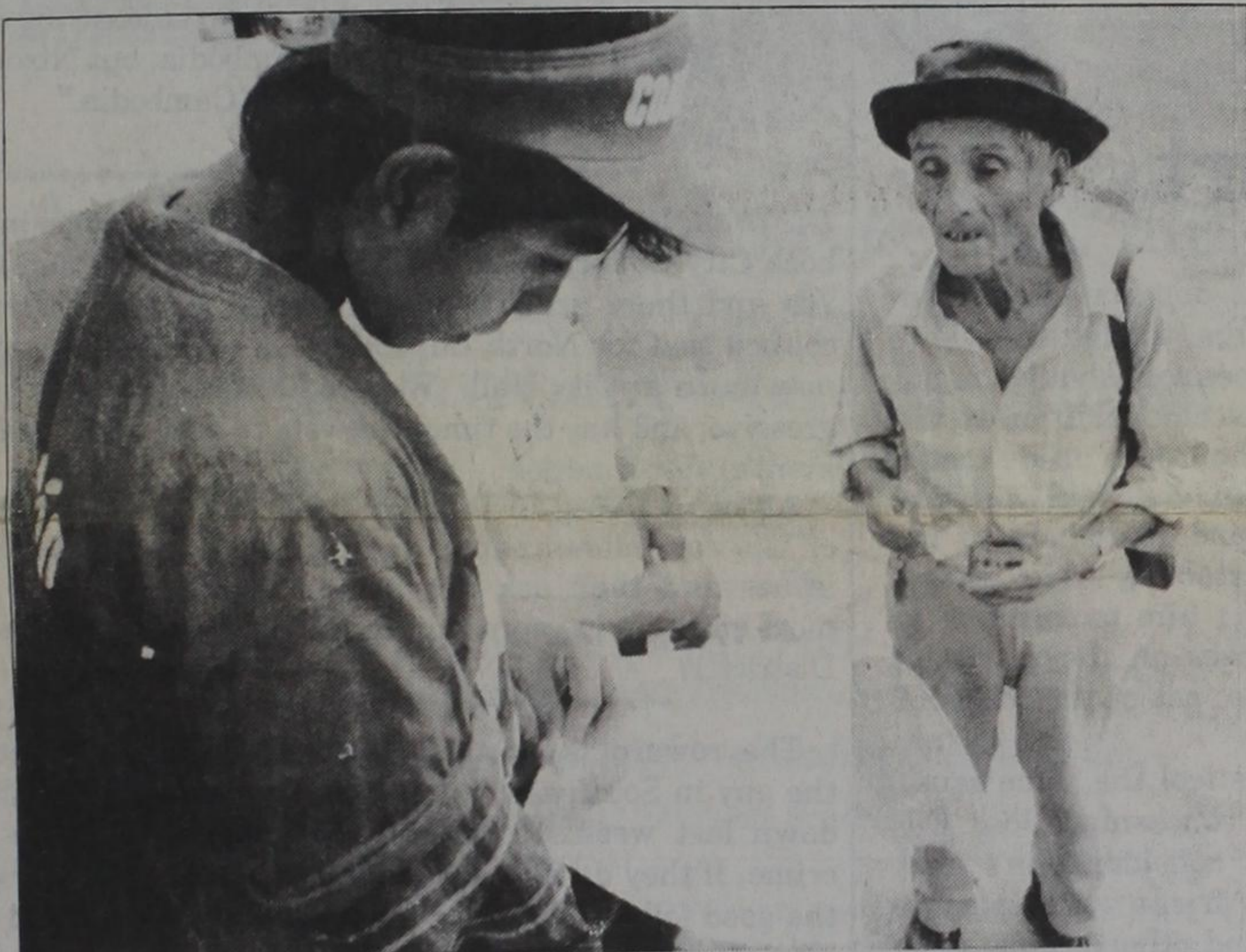
A voter in Mejicanos, a suburb of San Salvador, El Salvador, asks for help in looking for his name on a voter registration list Sunday.

San Salvador, El Salvador (AP)-Conservative Armando Calderon Sol overwhelmingly defeated his leftist opponent in Sunday's first presidential election since the end of El Salvador's civil war, unofficial returns showed.