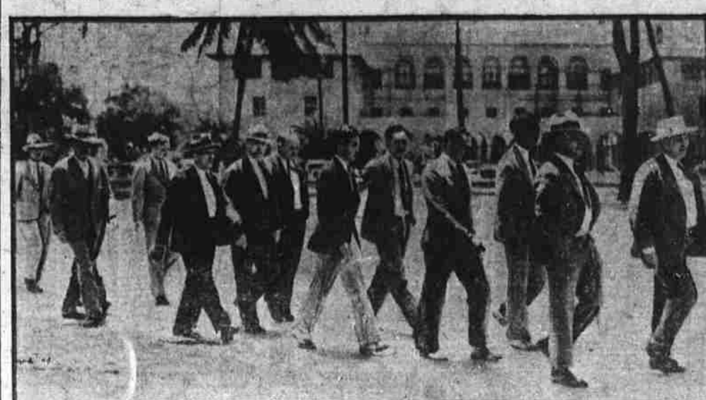
The jury of mixed races which is hearing evidence in the Honolulu trial of Lieut. Thomas H. Massie enroute to its hotel.