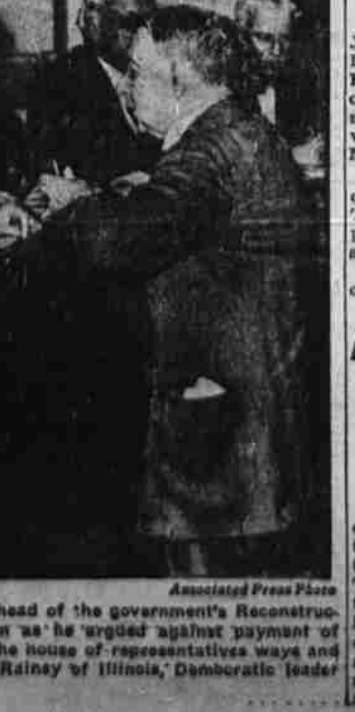
Charles G. Dawes (standing), head of the government's Reconstruction Finance corporation, is shown as he argued against payment of soldiers' bonus certificates before the house of representatives ways and means committee.