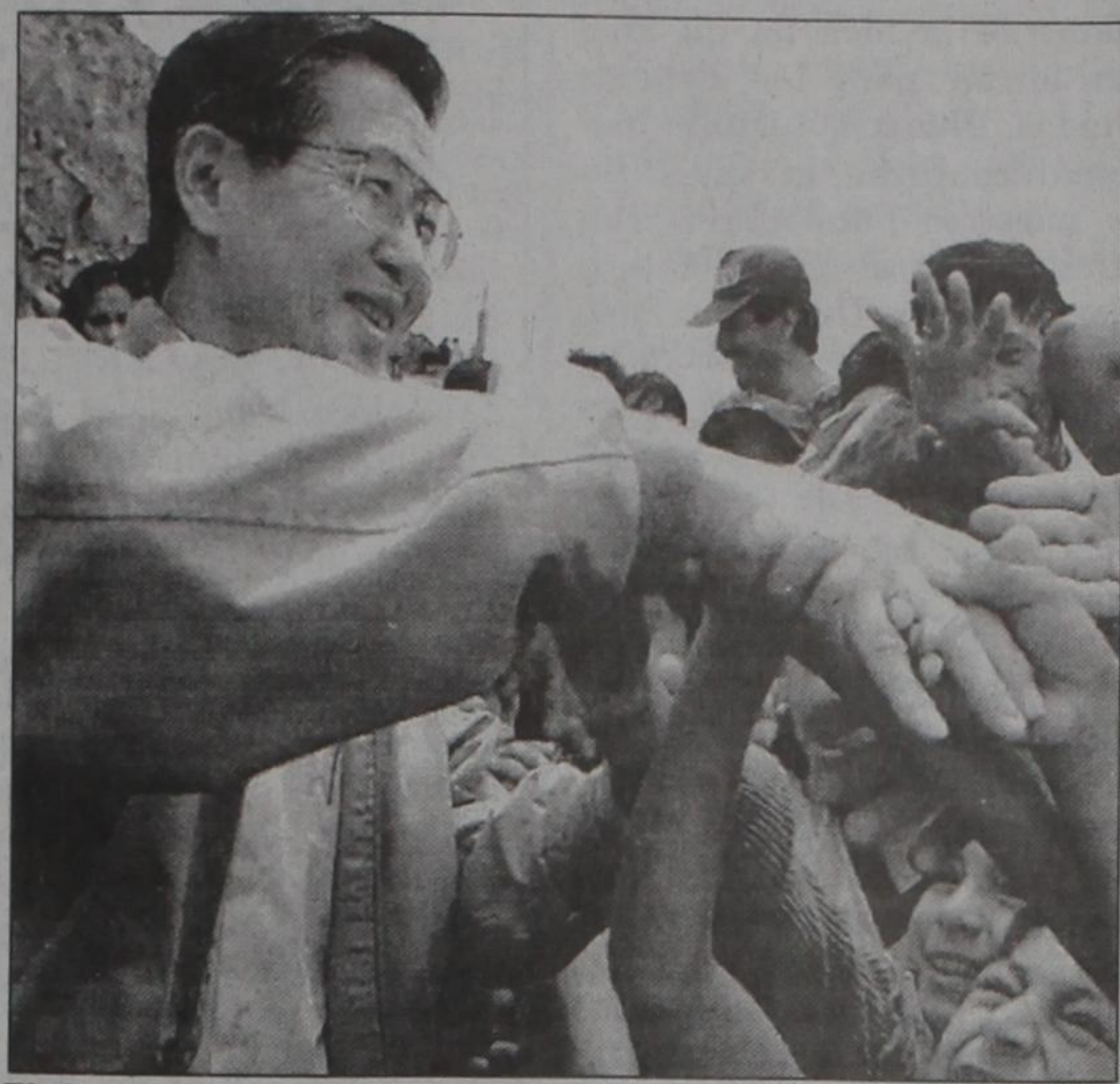
El Presidente Alberto Fujimori intenta poner fin a la crisis política más profunda de su carrera, pero su informe a la nación dejó sin respuesta varias preguntas cruciales sobre lo firme que es su control del país.

¿Qué precipitó esta declinación extraordinaria?