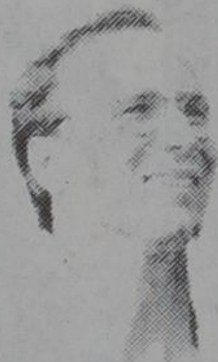
IMAGE Styling & Barber Shop Income Tax Service 217-B North University Lubbock, TX Tues-Friday 10-6 Saturday 8-4 Call (807)744-8271