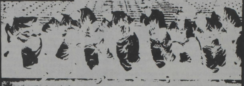
The old game of summer sunshine is now the televised game of autumn darkness, played almost until Halloween. Above, from a ghostly Ebbets Field, the spirits of one of baseball's most cherished line-ups cockily charge from their immortal dugout to the page of El Editor