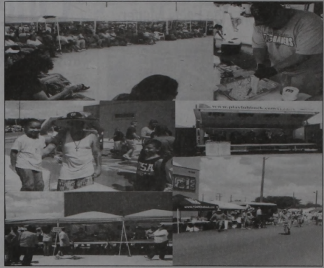
PHOTO ROUNDUP Sunday, August 21 ■ 2-4 p.m. ■ Charles Adams Gallery ■ 604 Avenue J

Please Come Share Your Photos for a Book on the History of Lubbock.