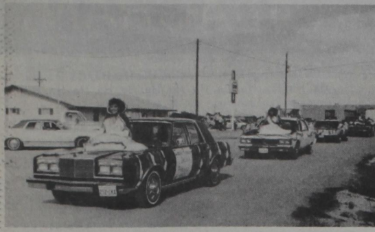
Participantes en el desfile en celebracion del 16 de septiembre en la ciudad de Idalou. Mas de 5,000 personas asistieron las fiestas que empezaron el lunes y terminaron el jueves.