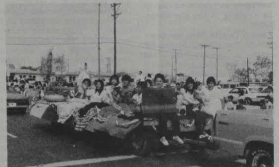
Barrio Mothers gano uno de los premios en el desfile de Lubbock que se llevo a cabo el sabado por el centro de Lubbock