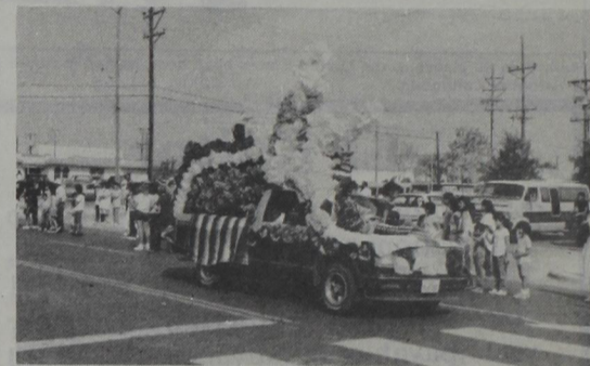
El Carro Alogorico de la escuela Harwell tambien participo en el desfile de Lubbock.

For more information contact the COMA office at 762-5059.