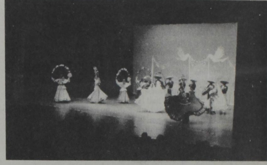
Uno de los mas entretenidos funciones en la celebracion de las Fiestas en Lubbock. El Balet Folklorico de San Antonio.