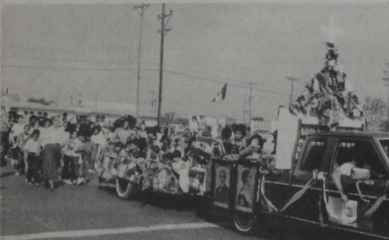
El Carro Alogorico de la escuela Bean en el desfile de Las Fiestas en Lubbock.