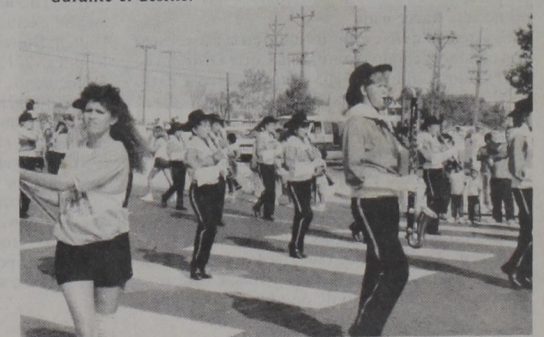
Miembros de la Banda de Lubbock High quien ganaron uno de los premios por su participacion en el desfile de Lubbock.

Espere Mas Fotos La Proxima Semana en El Editor