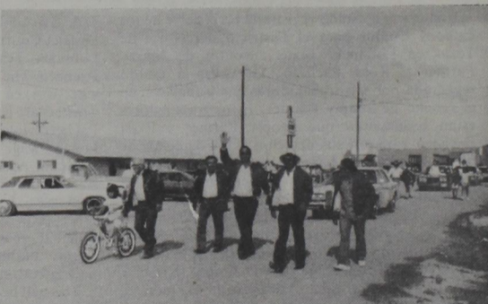
Miembros del Comite Patriotico de la Ciudad de Idalou durante el desfile.