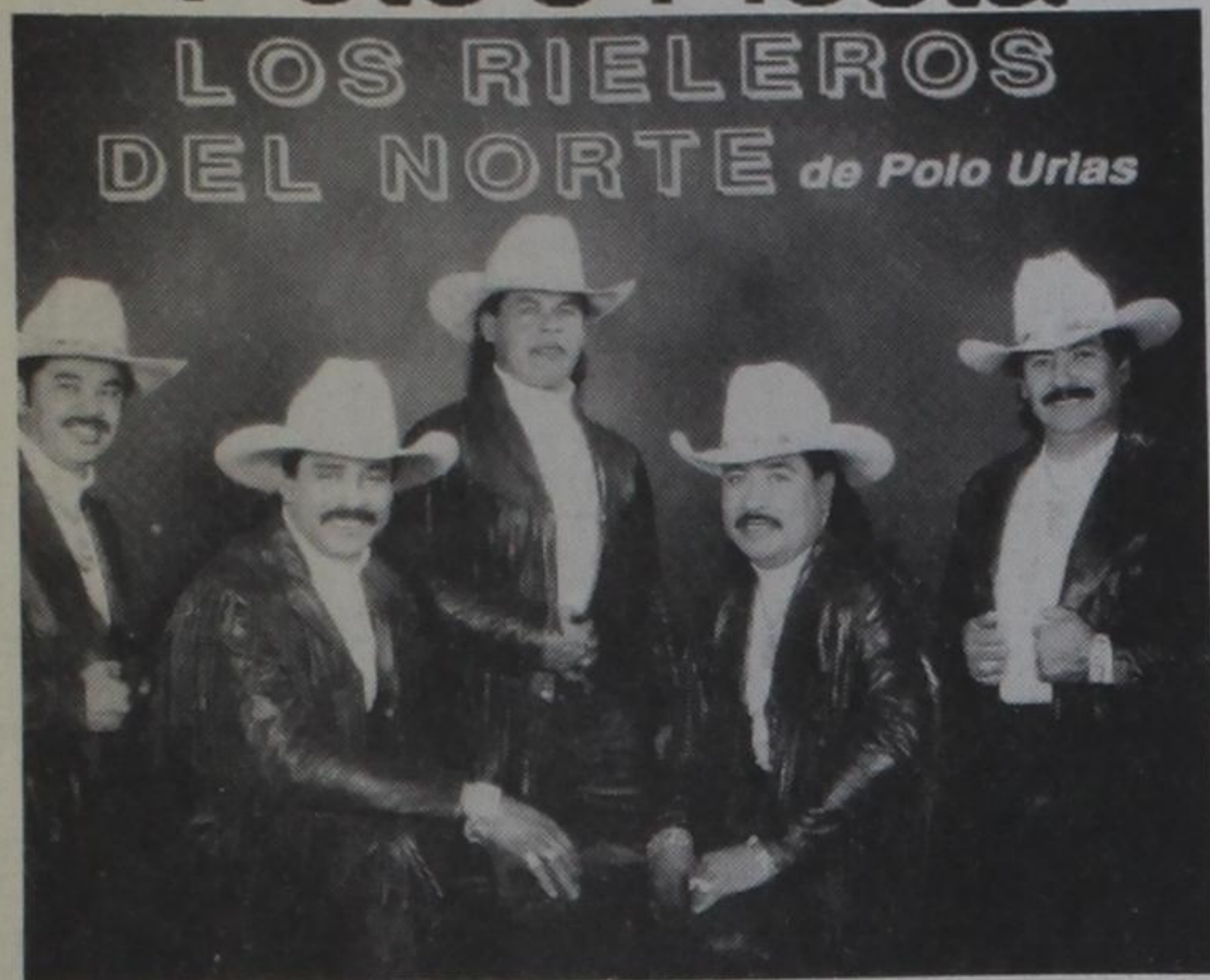
Los Rieleros del Norte