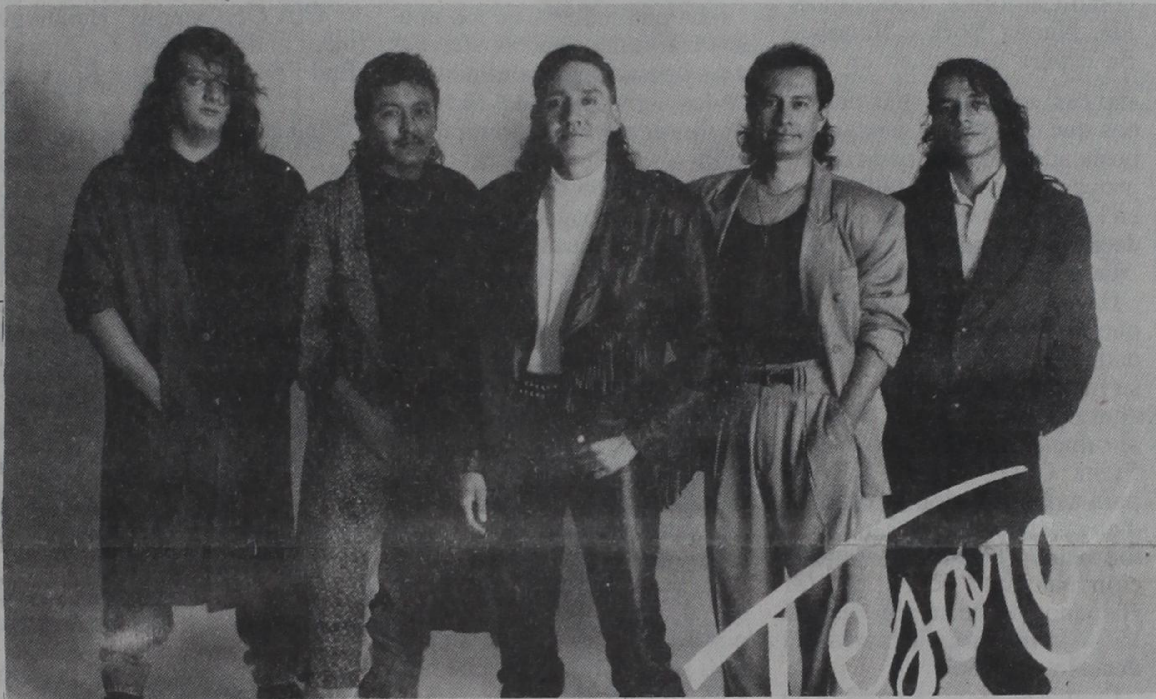
Tesoro will be one of the featured bands at the stage in the Concert area at the Memorial Civic Center. The Hispanic stage throughout the day will feature, Pura Vida, Corona, el Grupo Oro, Cervantes and Company, Peligro, Cierra Band, Viva la Musica and the Balet Folklorico de San Patricio.

Festividades de el Cuatro de Julio empiesaran el viernes por la tarde aqui en Lubbock con una comida que se sirvira en la Corte del Condado empesando a las 6 de la tarde hasta las 8 de la noche y un baile hasta las 10:30 de la noche