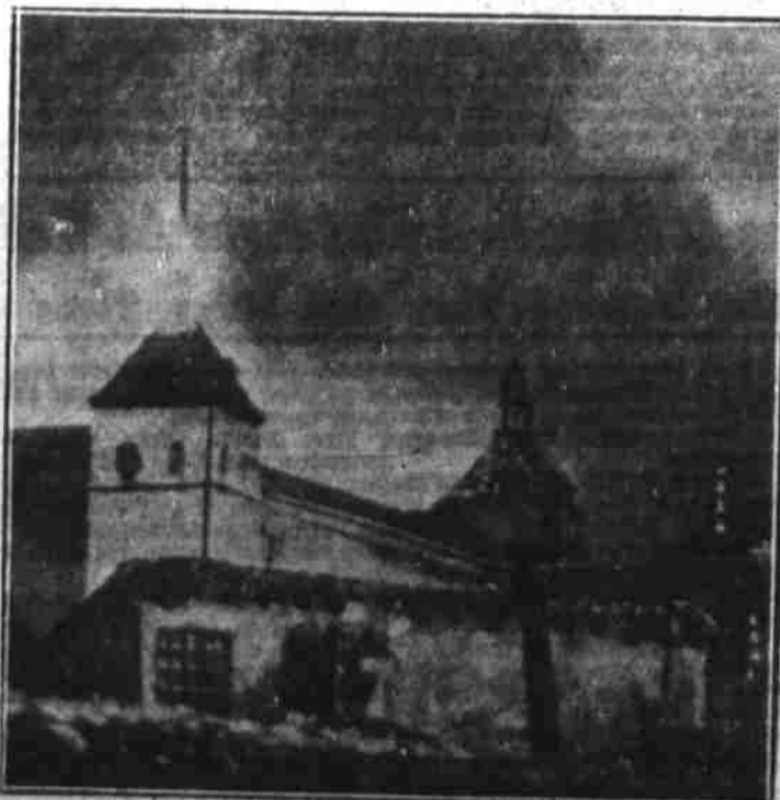
This graphic picture shows the burning of the famous Alcazar, citadel of Spanish kings and treasure house of priceless works of art, in the ancient city of Toledo. The tower is in flames after government planes bombed rebels barricaded in the building.