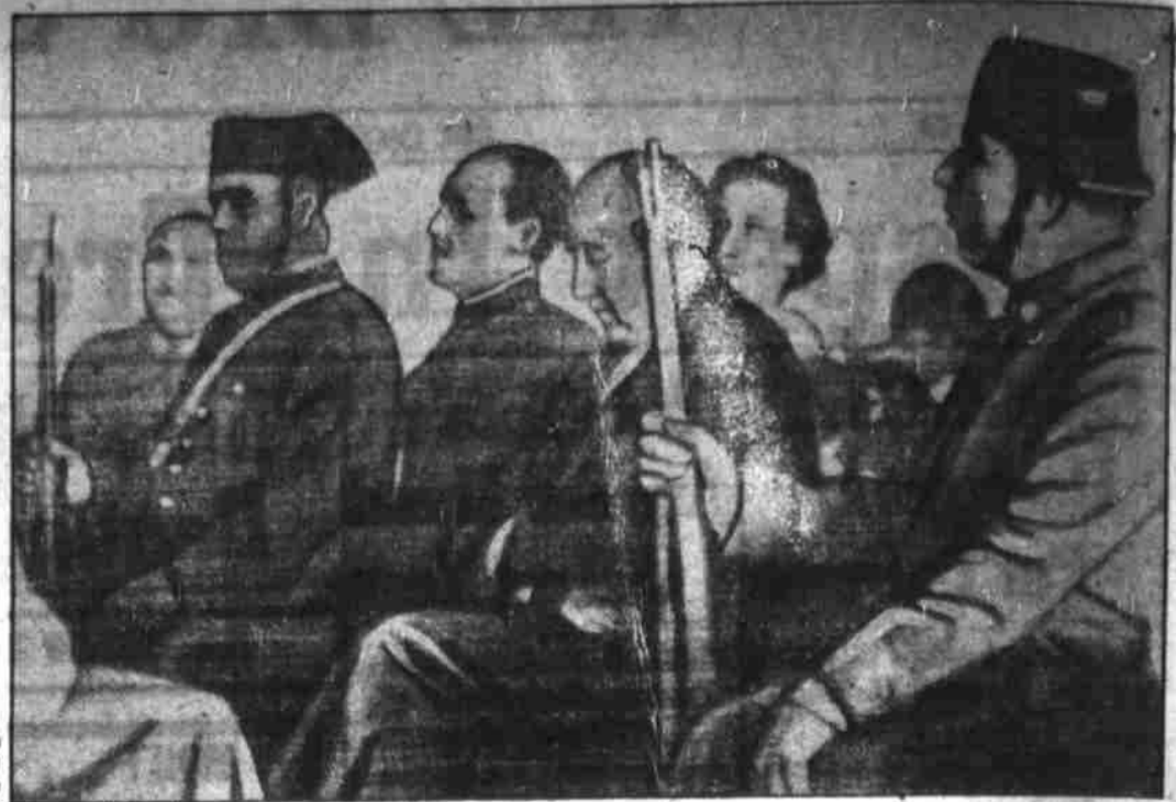
This picture, taken August 11 in Madrid, shows Generals Manuel Goded (left) and Alvaro Fernandez Buriel (right) between guards during a court martial hearing in which they were sentenced to death for treason. They were executed. This picture was sent to London by plane and radioed to New York.