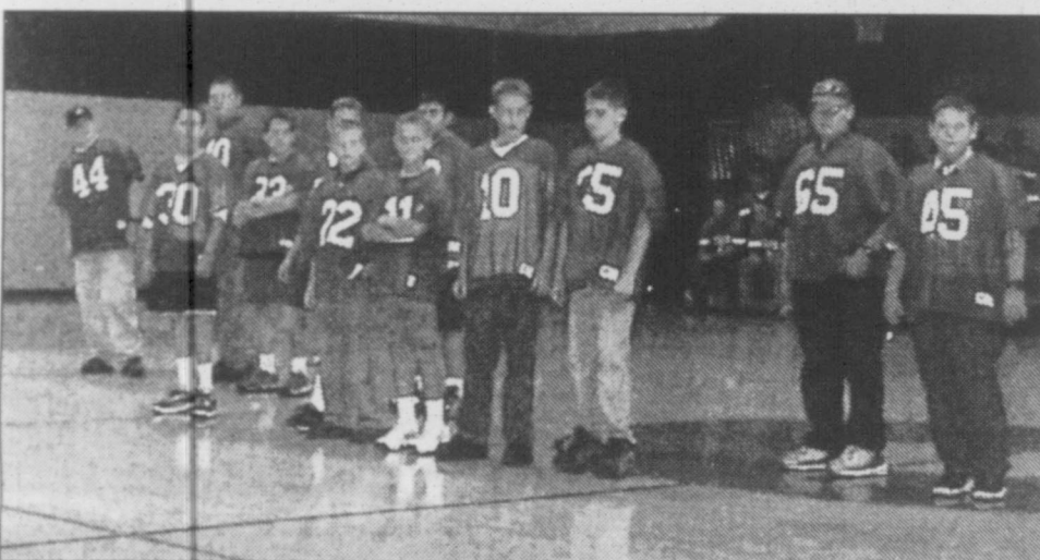
Junior high cubs are ready to roar