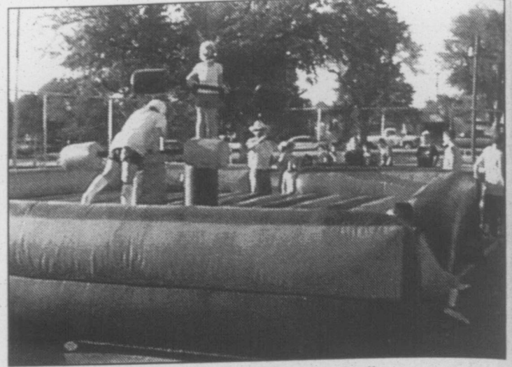
Students enjoy the blow-up toys at the back to school rally.

Building. All parents are invited and encouraged to come visit with your child's teacher and enjoy some refreshments.