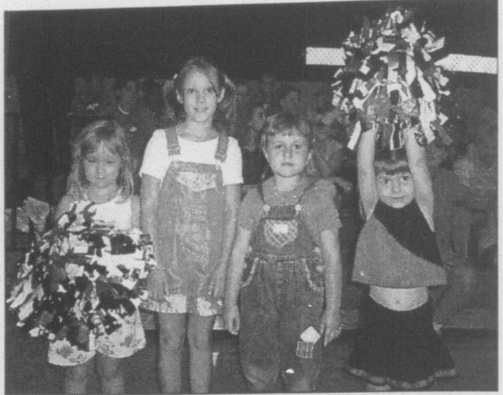
Tiger fans come in all sizes.