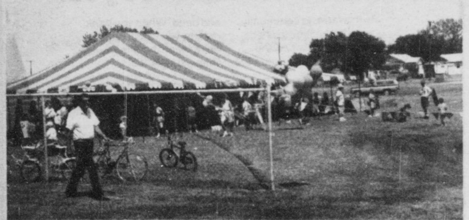
Young and Old enjoyed a day under the "Big Top Tent" during all the festivities of Groom Day.