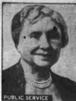
PUBLIC SERVICE HELEN KELLER