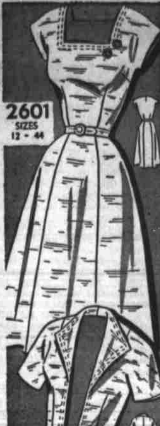
2601 SIZES 12-44

ments, and what better place for them than written on the record by the telephone. And best of all is the calendar with a new picture for each month. It almost makes you not mind the fleeting days just to have a different decoration. From the new one I have just received, I have learned that fishing is going to be good on lots of weekends during the coming year. If a person fishes just for the love of it, that fact won't make much difference, I guess. I've also become more familiar with the birthdays of famous people; not that it matters, though, as most of them are dead. However it's nice to know in case there is a lull in the conversation at some time, and then I can astound my friends with the question, "Did you know that tomorrow is John Fiddlefoot's birthday?"