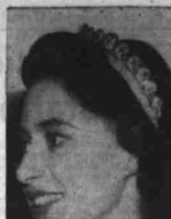
SPORTS BABE ZAHARIAS