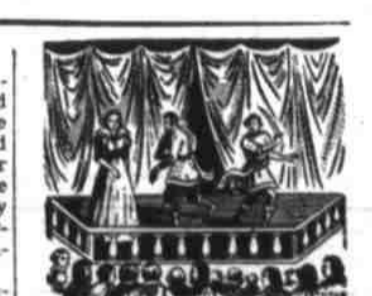
Actors performing in time of Shakespeare.

Although Shakespeare spent much of his time in London, he kept