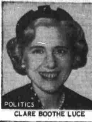
POLITICS CLARE BOOTHE LUCE