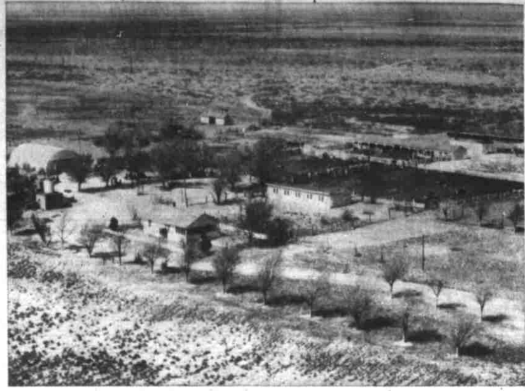
This Should Be Easy

The "Mystery Farm" for this week has so many distinguishing features that Herald readers should have no difficulty in identifying it promptly. The tree-lined driveway, quonset-type shop building, big pens and livestock sheds and the large water tank (left) go together to make up only one place. Who's it? The first person to contact The Herald with the answer to that question receives two passes to a Big Spring theatre. Owner of the place gets passes, too, and a mounted photograph of his farm or ranch headquarters.