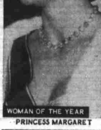
WOMAN OF THE YEAR PRINCESS MARGARET