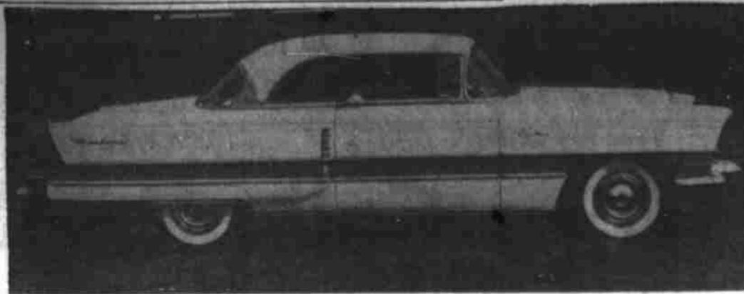
THE NEW CARIBBEAN HARDTOP MODEL IS DISPLAYED It features long, graceful lines and 3-tone coloring