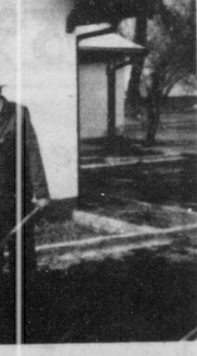
things cleaned up. This 90 degree weather just seemed to draw out all ages to do almost anything you could irragine.