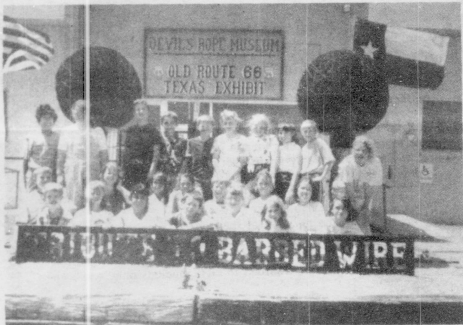
It is nearly the end of school and many of Groom's elementary classes have enjoyed field trips to numerous places. The 3rd and 4th graders recently enjoyed a visit to McLean's Barbed Wire Museum and Old Route 66 Museum. Students enjoyed a look at days gone by.