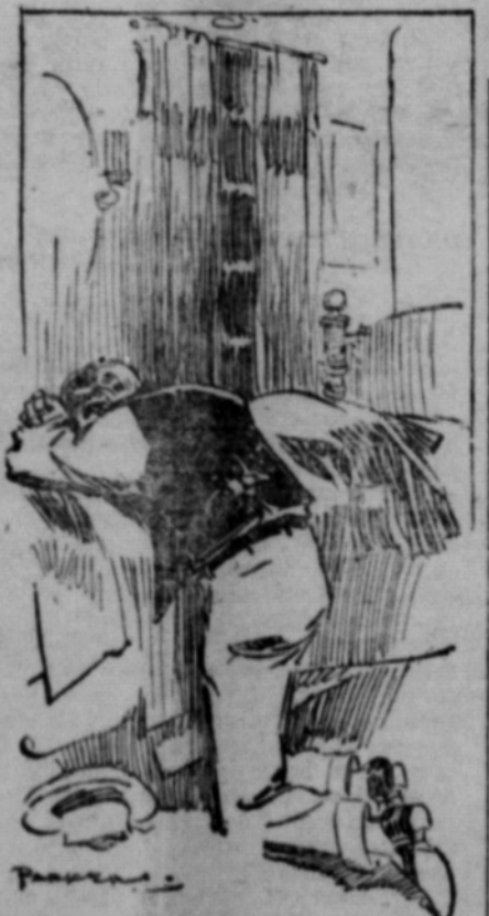
He Did Fenance for His Deepest Sin That Night.

him, he did penance for his deepest. sin that aight-and it may be that to this day some impressionable, overworked woman in a "kitchenette," to see a young man kneeling in the