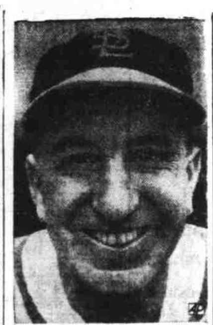
CASUALTY —Eddie Dyer, manager of the St. Louis Cardinals, was cut down by a batted ball in spring training camp at St. Petersburg, Fla., yesterday. He suffered a mild concussion when the ball hit him in the back of the neck. He'll probably be back in action shortly.