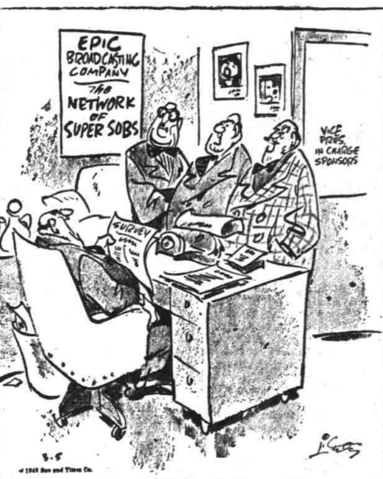
"But how can people say the Quality of Radio needs improving?—Why, every show we got has a sponsor!"