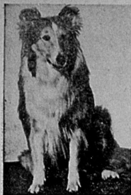
A DOG'S LIFE —Lassie, famous dog of screen and radio, will be heard in a new NBC show, beginning Saturday, June 5. "The Lassie Show" will dramatize Lassie's own life story.

Best Selling Items More than 50 per cent of all canned fruits, vegetables and juices sold in the last few years come in the No. 2 can. That's the 20 ounce container with approximately 2 1/2 cup content.