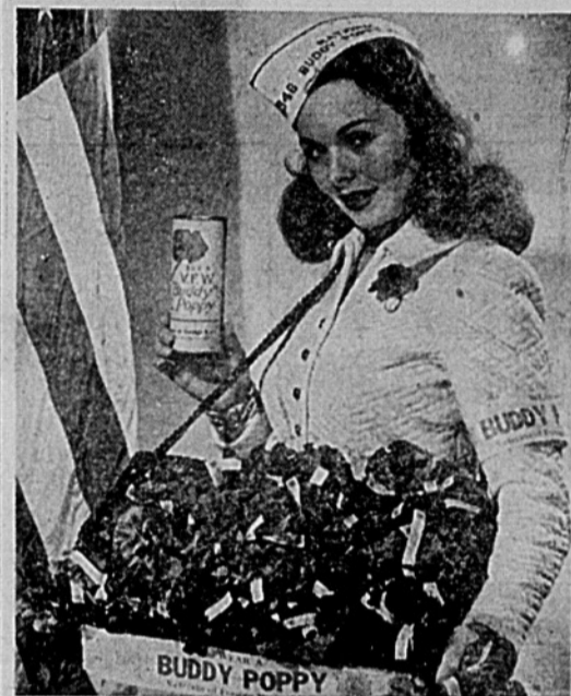
JEANNE CRAIN, Twentieth Century-Fox motion picture star, is the Veterans of Foreign Wars National Buddy Poppy Girl for 1948.

While Miss Crain will not likely appear on the streets of Slaton to sell poppies tomorrow, there will be a number of home town women who will have just as sweet a smile for you and the money you give