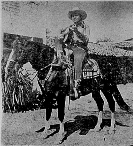
LUBBOCK, Texas, May 24 — American Business Club for the benefit of the capital fund of the Lubbock Boys' Club.

Mail orders for tickets should include check or money order, and should be sent to the ABC Rodeo, Hilton Hotel, Lubbock, Texas. Box seats are $3.00, seats are $2.00, and children's tickets are $1.00, all with tax included.