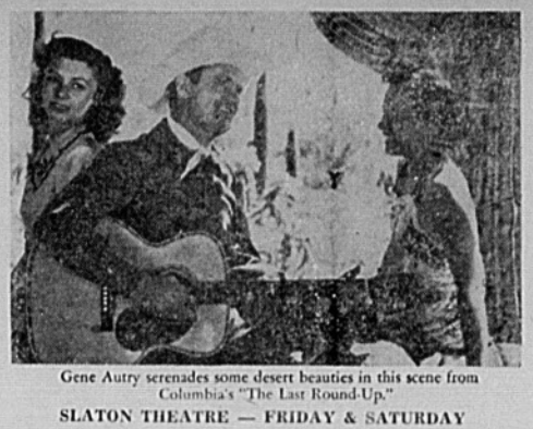
Gene Autry serenades some desert beauties in this scene from Columbia's "The Last Round-Up." SLATON THEATRE — FRIDAY & SATURDAY