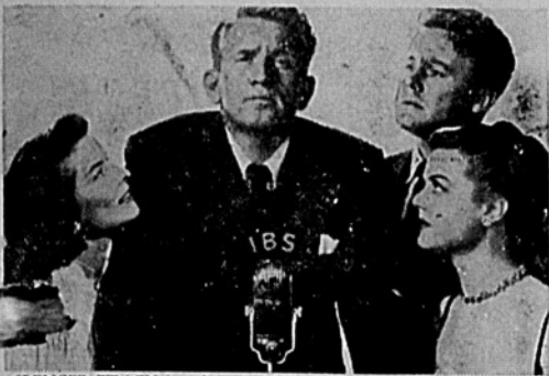
SPENCER TRACY broadcasts as Katharine Hepburn, Van Johnson and Angela Lansbury look on, in MGM's "STATE OF THE UNION."