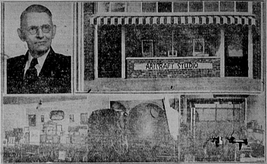
THE HOME OF BETTER QUALITY PHOTOGRAPHY