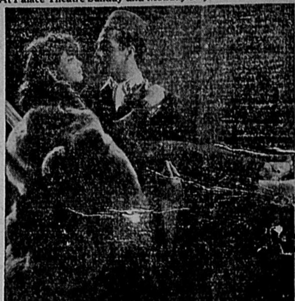
Dangerous drama and emotions build up the relationship between Gene Tierney and Victor Mature in "The Shanghai Gesture," Arnold Pressburger's film version of the famous stage play, now at the . . . Theatre.

At Palace Theatre Sunday and Monday July 19 and 20