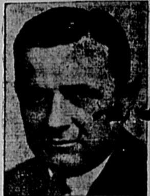
JAMES V. ALLRED

In the more than one hundred years of Texas history, Texas has never been represented in the United States Senate by a West Texan. This year, for the first time, you have an opportunity of electing a West Texan to that high position by voting for James V. Allred, who was born and grew to man hood in West Texas, and who knows and understands the problems of West Texans.