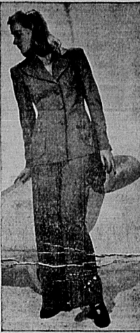
Perfect for a country or city fire-side is this pajama suit cut on dateless, classic lines. It's practical, says the January Good Housekeeping for wear indoors or outdoors, day or evening.