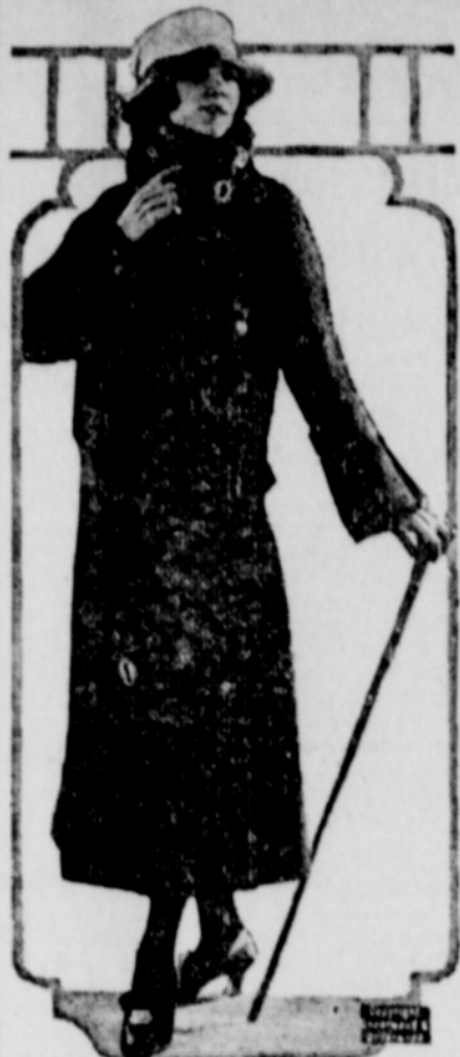
This smart new fall coat is of navy blue material. It is cut with charming simplicity and attains distinction by the closure, a single broad buckle of dark blue enamel. Fine beaver trims the collar and cuffs.