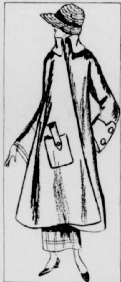
Topcoat of Green With Cloth Single Pocket and White Buttons.

Another firm has several very excellent cloth coats. One particularly attractive model is of green and gray wool combined. The outside of the coat is of the gray applied with green, while the inside is of green.