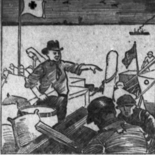
2. His personal direction in this emer-gency brought order out of chaos