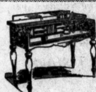
The Spinet Desk, easily converted into a lovely table.

"The Latest For Less" 166 Texas Avenue Phone 272