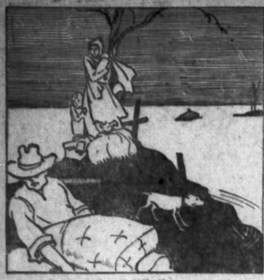
In the Spring of 1927, Hoover was ap-