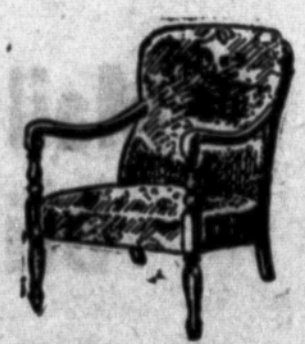
The Occasional Chair is very popular, adding color and charm to a living room.