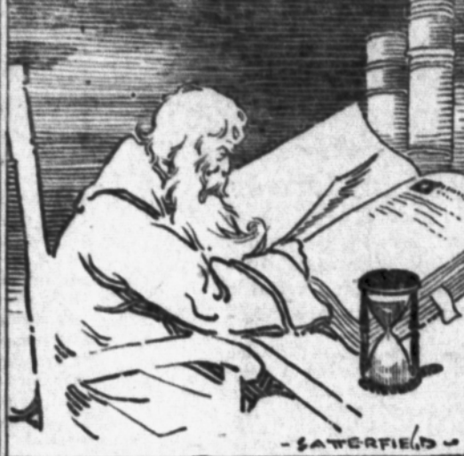
4. Into History's pages are yet to be written the final works of this man who does big things.