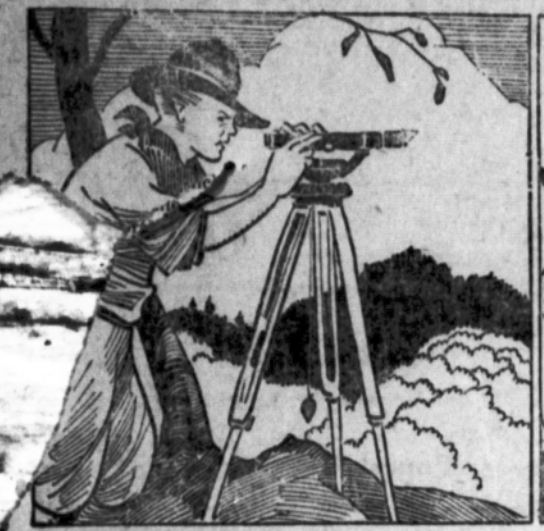
His first field work as an engineer apprentice was the Ozark Mountains, during college vacation.