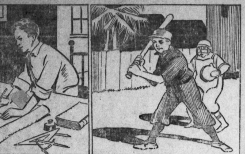
2. Baseball was his favorite cellege sport, and he proved an expert at the strategy of the game.

Humans are by no means the only victims of the chigger. Normally they feed upon small wild animals, including snakes and lizards and they may attack birds. They are a pest of considerable importance to poultry, and are especially troublesome on late hatched chicks and turkeys. Heavily infested chicks soon become droopy and drowsy, later may show sympstrawberries shipped from this place West Texas Press association here, president of the Motion Picture Pro- days. Early hatching usually prevents losses of poulrty. Late hatches should be kept out of high grass and brush when chiggers are prevalent. The use of sulphur as described gives some protection, but usually if the chicks range they will become infested. On chickens the chiggers are inclined to Motors combined. Investment in the attach in dense masses on the parts of the body less covered by down of feathers, and a light dusting with sulnationally known firm of accountants phur will give some relief.