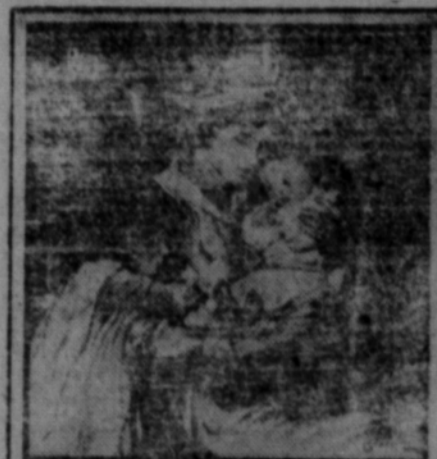
THE AMERICA of TOMORROW