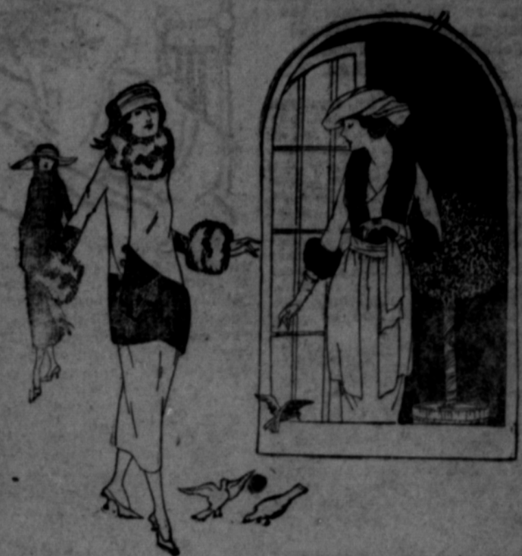
Children's and Misses' Clothes in Vast Assortment at 20 PER CENT OFF.