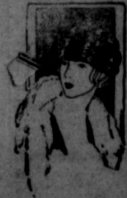
LADIES' GLOVES. NEW LINE JUST RECEIVED. PRICED WITH THE TIMES.