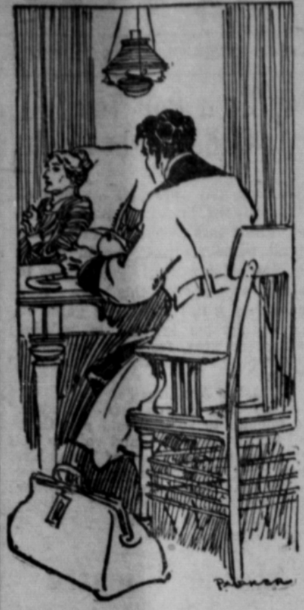
Eugene Thought Himself an Idlot.

chair across the table from her, watched her profile, thought himself