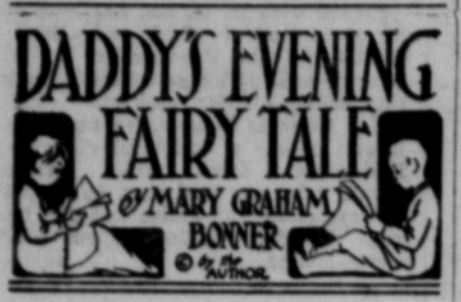
GAMES AND TOYS TALK.

"Well," said the game of soldiers, "those toys had a fine talk the other day, but now that