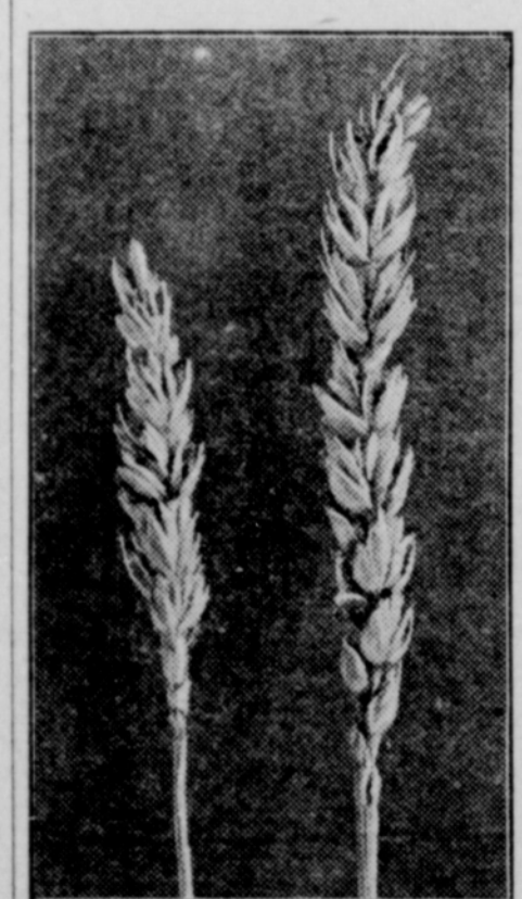
Bunt or Stinking Smut of Wheat-Two Smutted Heads.

This smut disease is caused by a parasitic fungus which attacks the growing wheat plant before the first