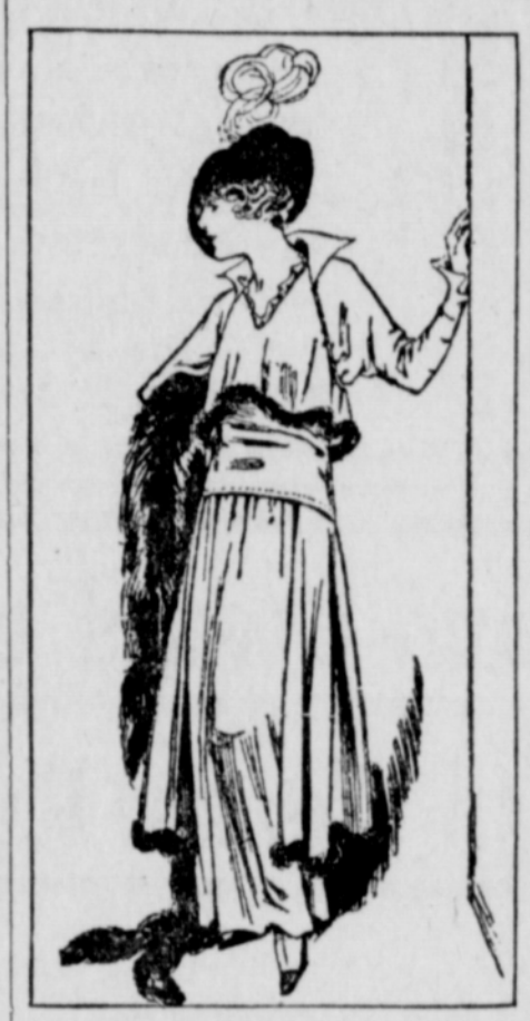
Model Showing the Grace and Dignity of the New Straight Lines.

The loose, skirtlike blouse is held to the figure only along the cording that describes a raglan sleeve line. Its furbordered hem hangs unconfined over a hip girdle of the dress material. The