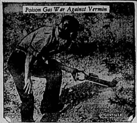
egular war-time gas is being used to kill rats on Riker's Island, New and the same method is effective against gothers, woodchucks and