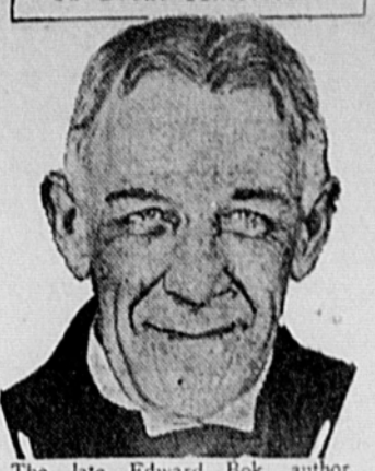
journalist and philanthropist, who came to this country from Holland at the age of six and made himself one of the nation's most useful citizens