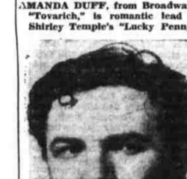
JOHN GARFIELD (he was Jules Garfield in "Golden Boy" and "Having Wonderful Time") is in "Sliter Act."