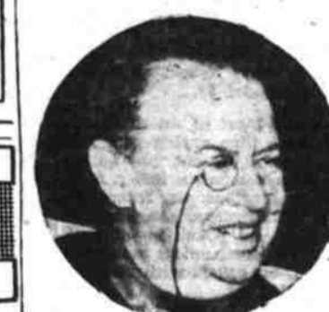
CHARLES COBURN already has impressed movie-goers in "Of Human Hearts," "Yellow Jack" and "Vivacious Lady."