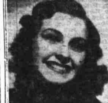
NANCY KELLY, recently with Gertrude Lawrence in "Susan and God," is here to make "Splinter Fleet."