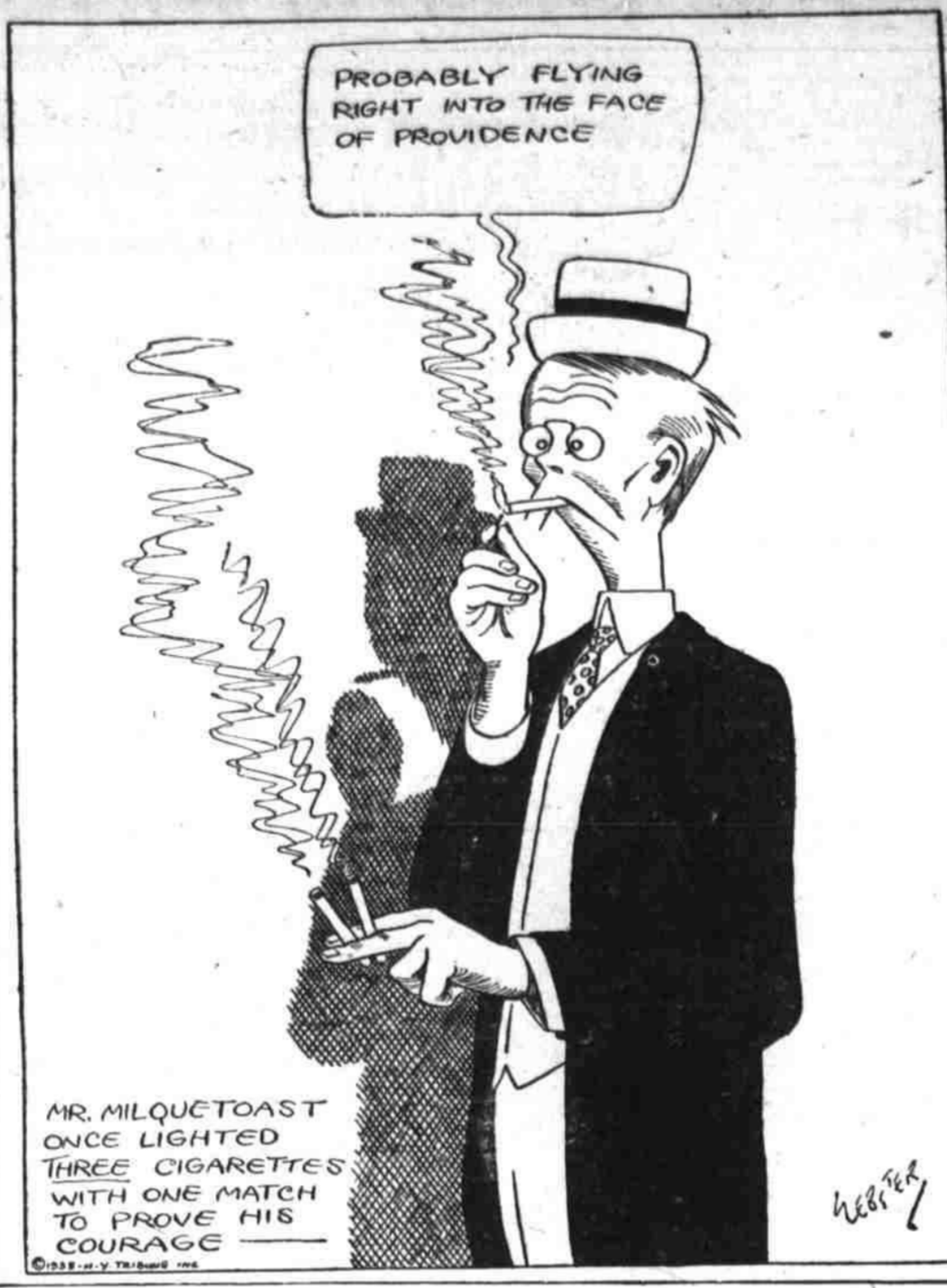
MR. MILQUETOAST ONCE LIGHTED THREE CIGARETTES WITH ONE MATCH TO PROVE HIS COURAGE