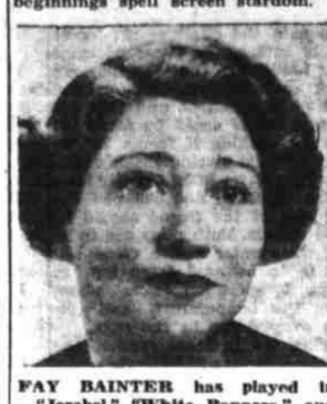
FAY BAINTER has played in "Jeebel," "White Banners," and now "Mother Carey's Chickens."

HOLLYWOOD—WITH CUTS... HOLLYWOOD—The raid on the Broadway stage that began 10 years ago with the first talkies continues as Hollywood adds new names to its star roster.