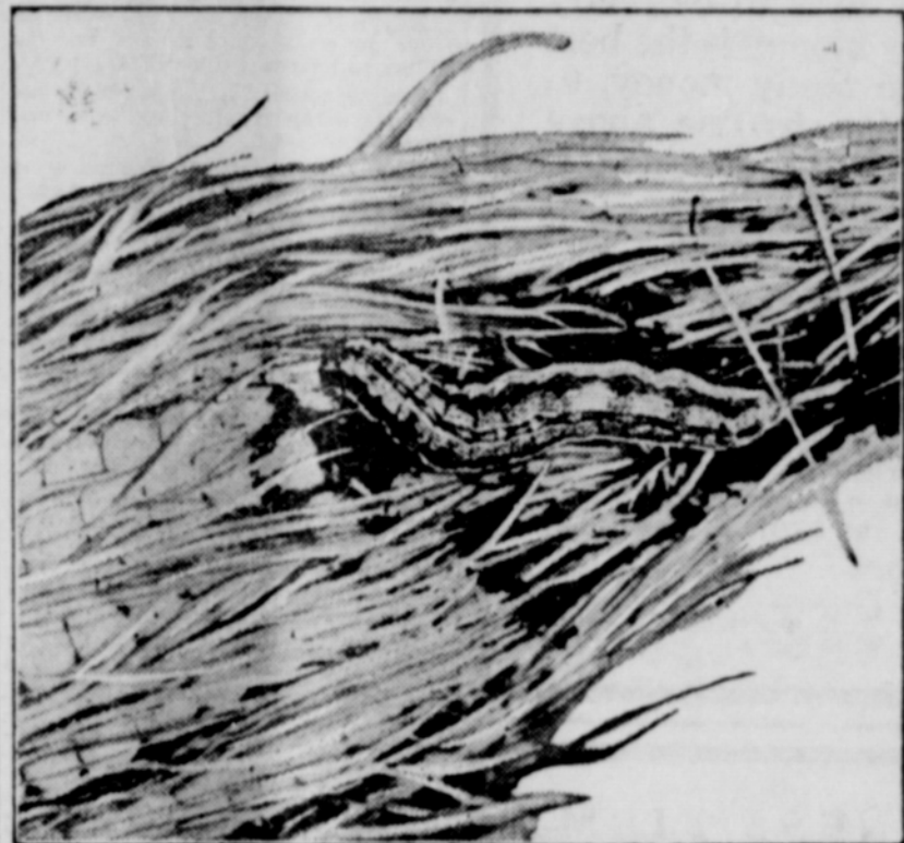
Enormous Loss Can Be Reduced if Corn Grower Will Select Variety With Long, Tight Husks.

The corn earworm is also an important enemy of several other crops.