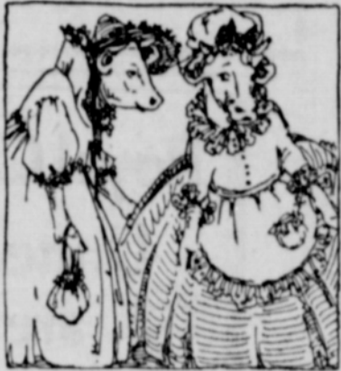
"I Have a Good Reputation."

"Then I know the word pail and I know the word milk, and I know the