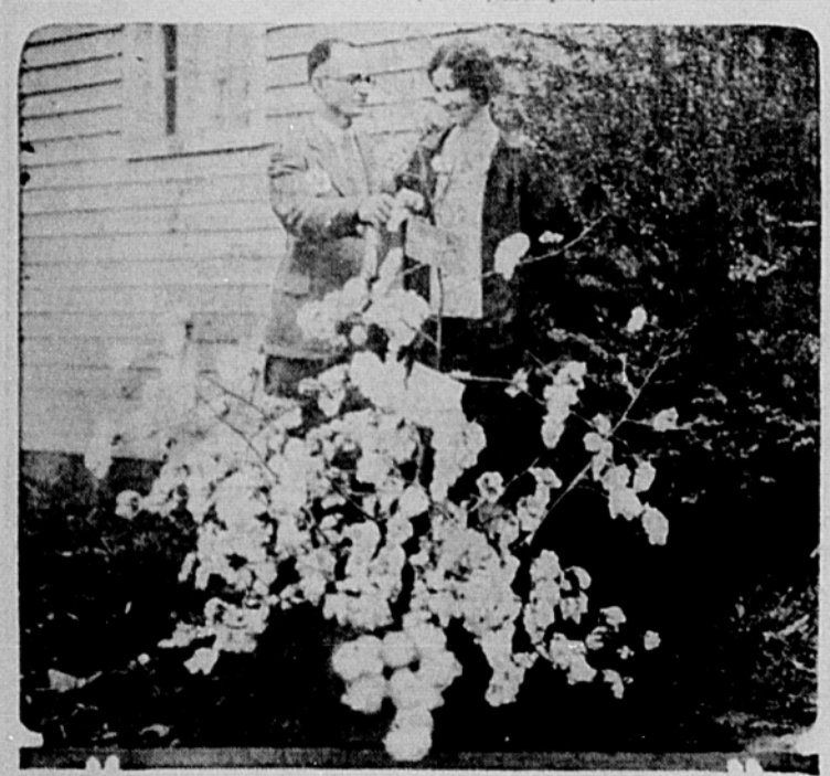
in National Cotton Show, 1928.

Exhibitors need not necessarily accompany exhibits, but may ship same, charges prepald, to the National One-Stalk Cotton Show, in care of the fair in their district. Entrants living in Virginia, North Carolina, South Carolina, Georgia, Alabama and Florida should enroll by sending their names and addresses to The National Cotton Show, Atlanta, Georgia. Those in Oktahoma and Texas to The National Cotton Show, Dallas, Texas, and those in Tennessee, Mississippi, Arkansas, Louisiana, Missouri, and Kentucky to The National Cotton Show, Memphis, Tenn.