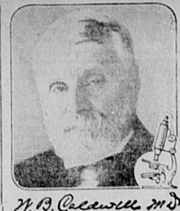
AT AGE 83

ful people telling us that it helped them when everything else failed. While women, children and elderly people are especially benefited by Dr. |