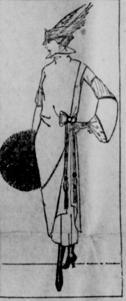
Frocks of Heavy Silk Crepe Draped and Slightly Fitted.

American women, as one clever designer put it, "are not in the balbriggan class," Through the cold months of the year they ride in motors, stepping, by this means, from warm apartments to warm hotels or shops. They are bounteously supplied with furs that ing any transition state, and therefore they can wear what they will. And they will to wear soft, flowery lines most appropriate to their beauty. But these soft satip and silk and chiffon once they were, being designed for occasions surrounded by formality.